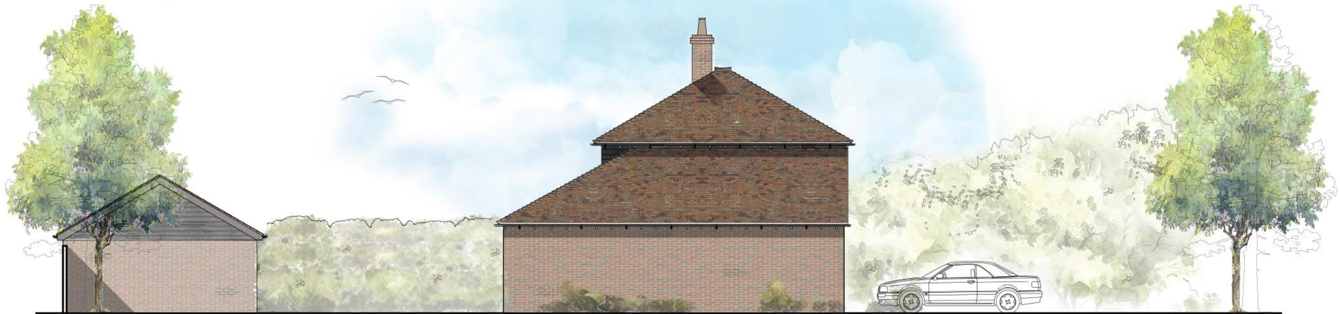
South East Elevation as Proposed 1:100