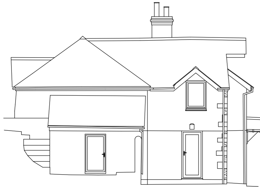
South Elevation (The Old Mill)