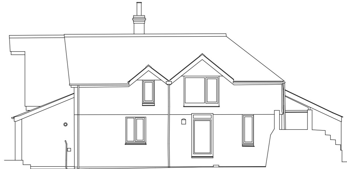
West Elevation (The Old Mill)