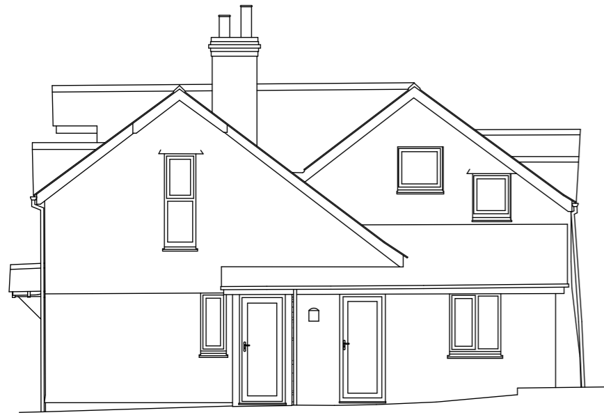
North Elevation (The Old Mill)