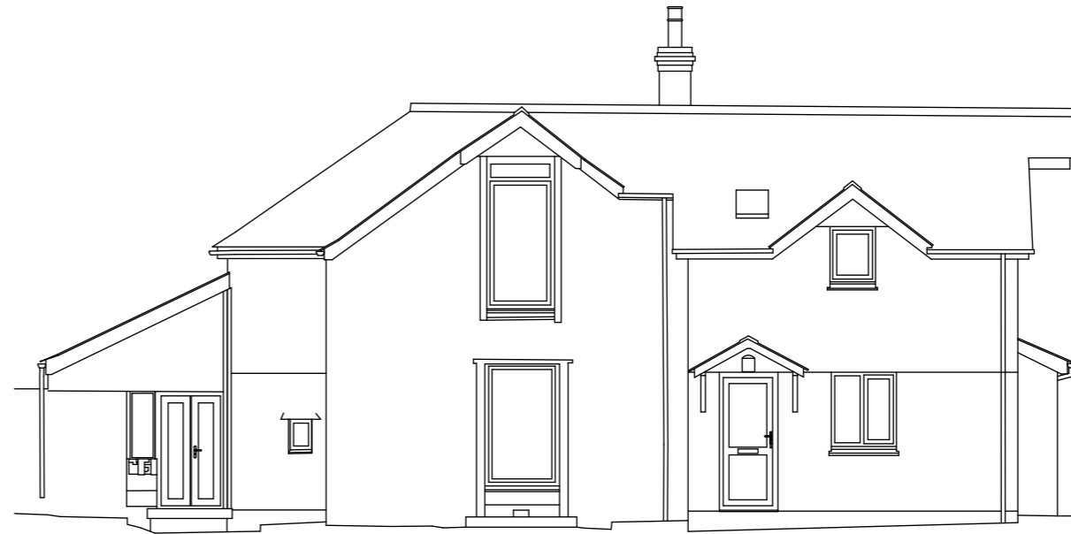
East Elevation (The Old Mill)

Notes: Copyright retained in accordance with the copyright design and patents act 1988. Dimensions must not be scaled from this drawing. The contractor is to check and verify all building and site dimensions before work is commenced. The Contractor is to check and verify with all Statutory Authorities and Employer the local and condition of any underground or overhead services or confirm that none exist prior to work commencing on site.