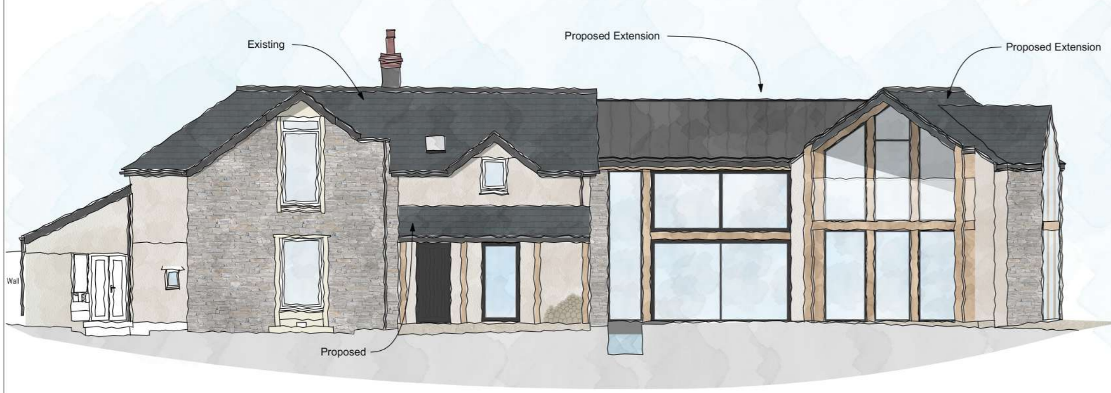
Proposed East Elevation Scale 1:100

CDM Regulations, require all projects to: - Have workers with the correct skills, knowledge, training and experience. - Contractors providing appropriate supervision, instruction and information. - A written Construction Phase Plan. Swain Architecture are appointed as 'Designer' only, unless appointed by the client in writing to confirm Swain Architecture's role as 'Principal Designer'.