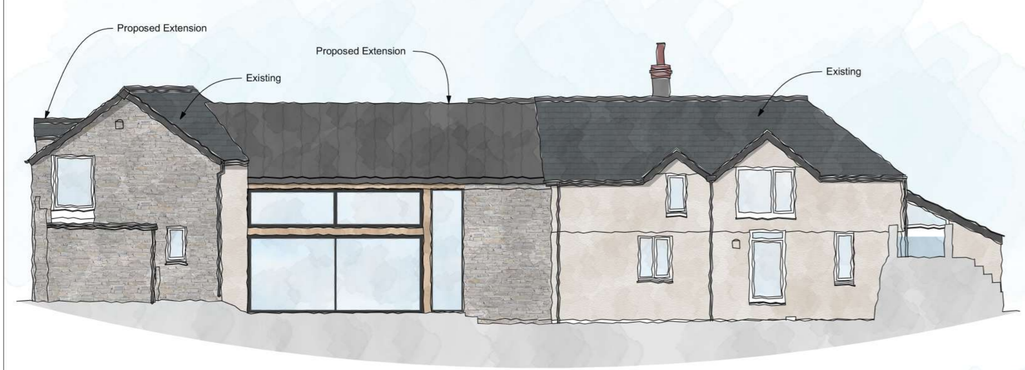
Proposed West Elevation Scale 1:100