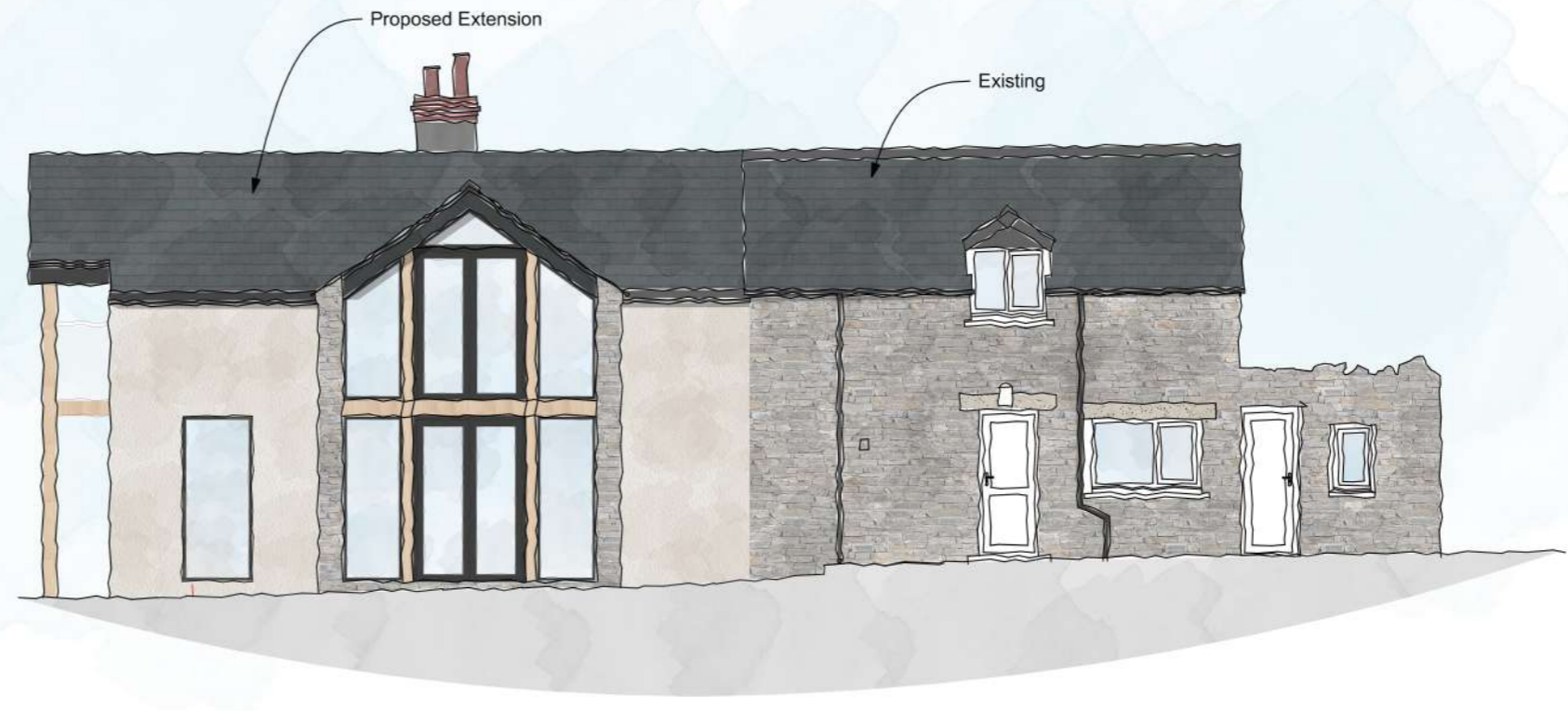
Proposed North Elevation Scale 1:100