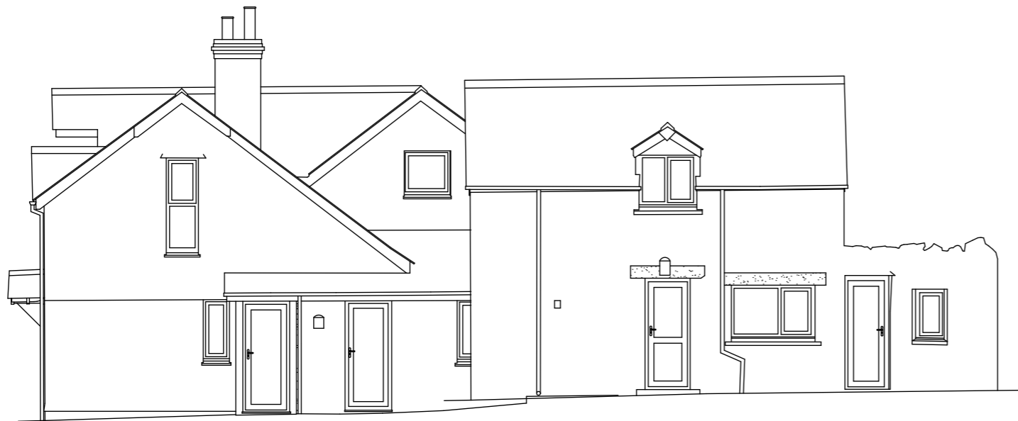
North Elevation (Site)

Notes: Copyright retained in accordance with the copyright design and patents act 1988. Dimensions must not be scaled from this drawing. The contractor is to check and verify all building and site dimensions before work is commenced. The Contractor is to check and verify with all Statutory Authorities and Employer the local and condition of any underground or overhead services or confirm that none exist prior to work commencing on site.