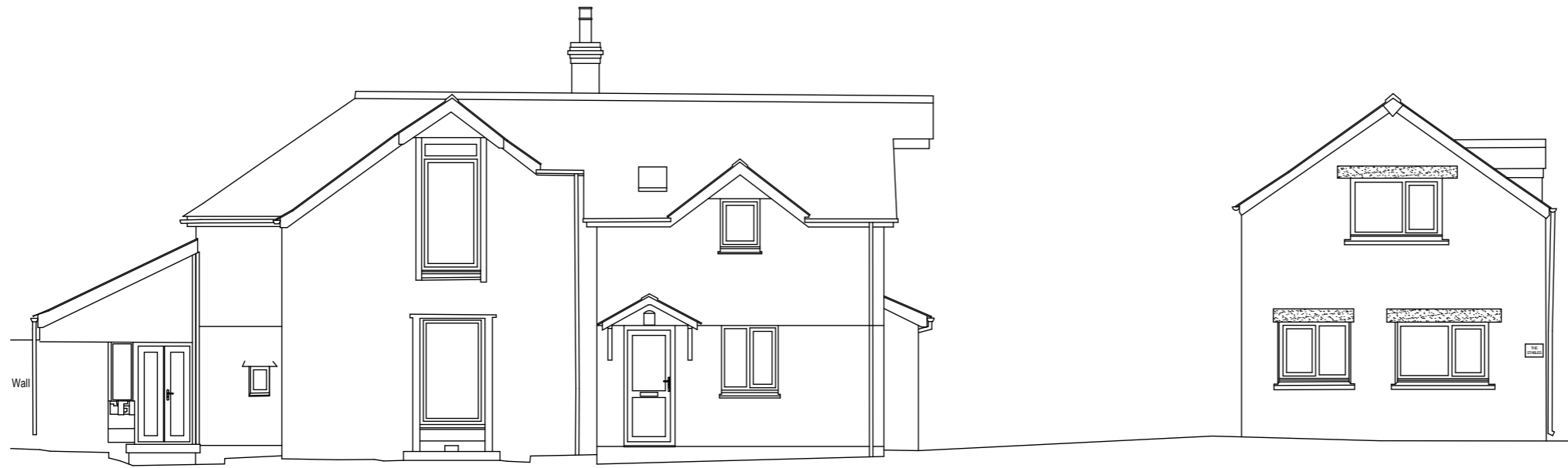
East Elevation (Site)