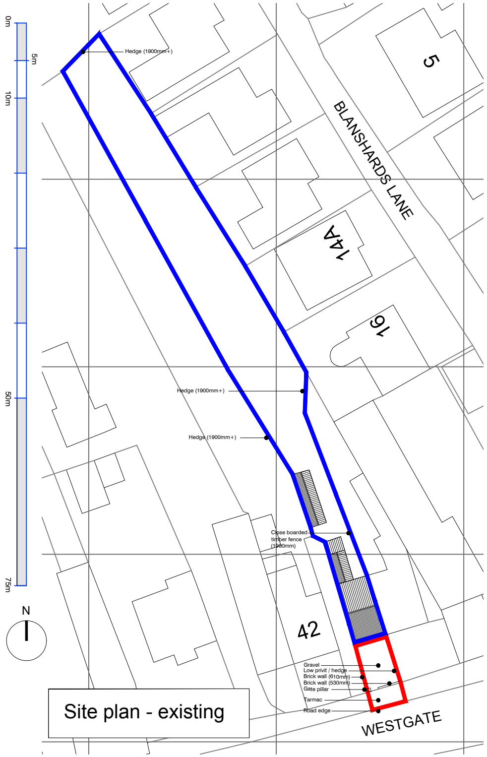
Site plan - existing