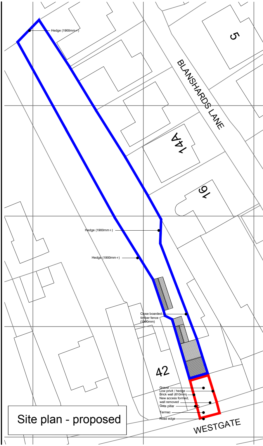
Site plan - proposed

Notes This drawing is to be read in conjunction with all related Architectural, Engineer's and subcontract drawing packages. Please also refer to specialist manufacturers information and strict installation guidance. This document is the copyright of Plan architecture. It is made available on the express condition that it shall not be used in connection with any other project than that noted. © PLAN Contact - 07779323211 Details subject to final structural proposals. Building Control technical submission shall form separate drawing pack. For client comment and approval. Specification to be agreed with client. Coordinate with room elevations and other relevant specifications on site. All levels and dimensions to be checked on site. Party wall matters under separate instruction. Coordination of fire strategy to be concluded separately.