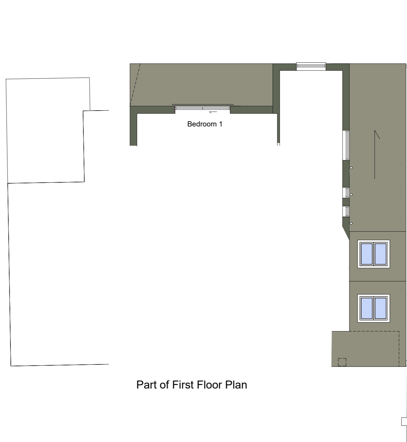
Part of First Floor Plan