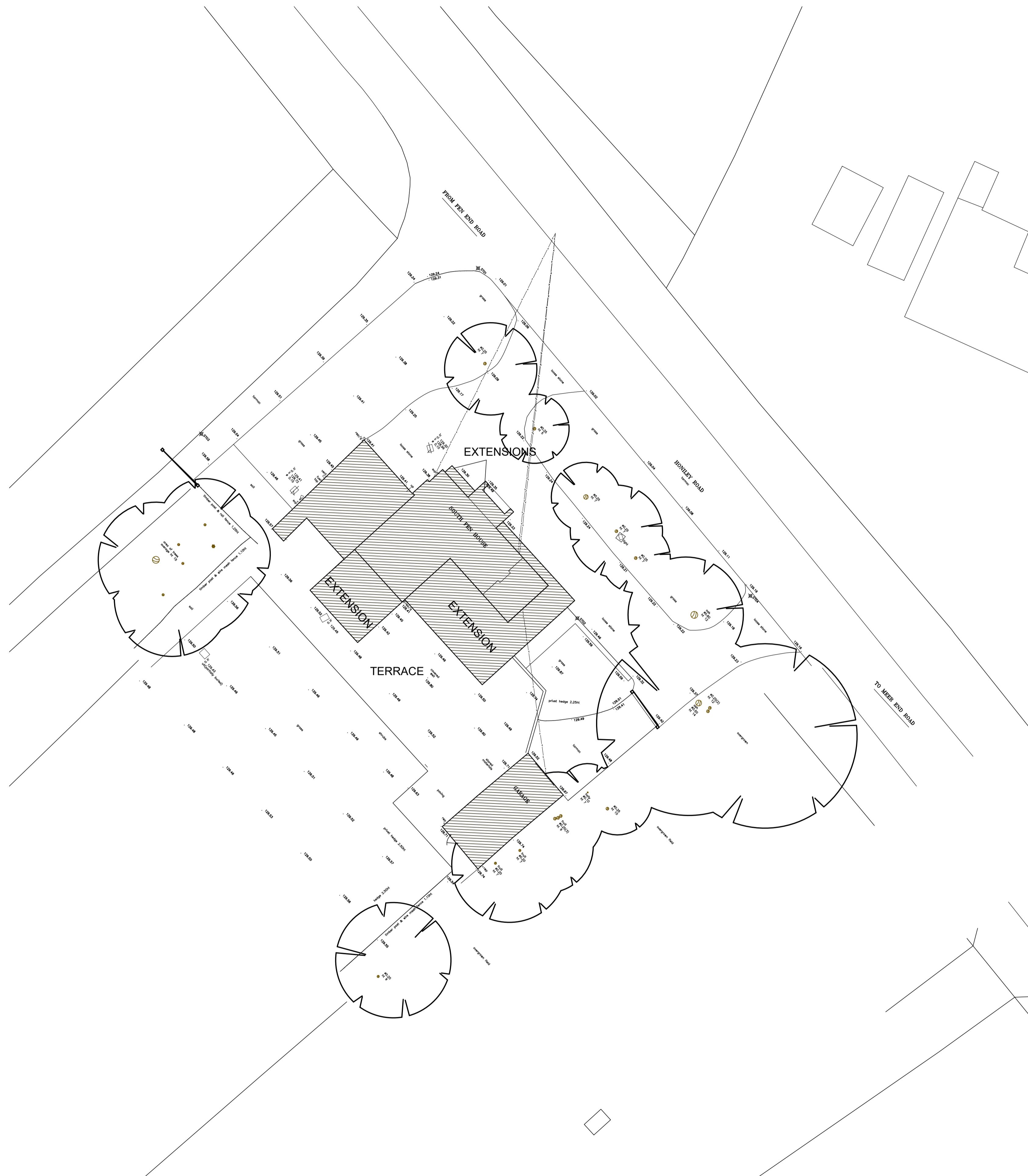
PROPOSED SITE PLAN SCALE 1:200 @A1