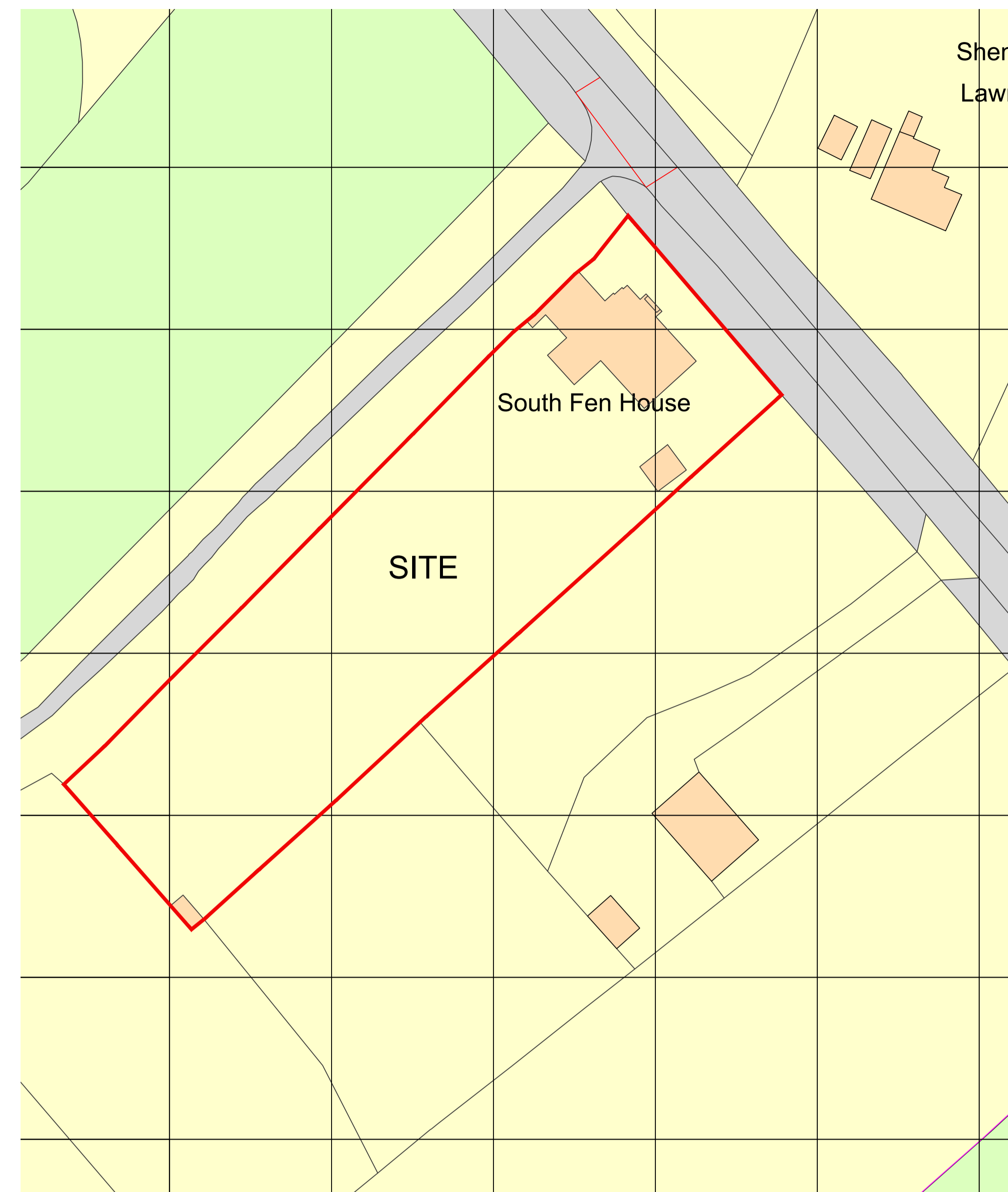
PROPOSED BLOCK PLAN SCALE 1:500 @A1