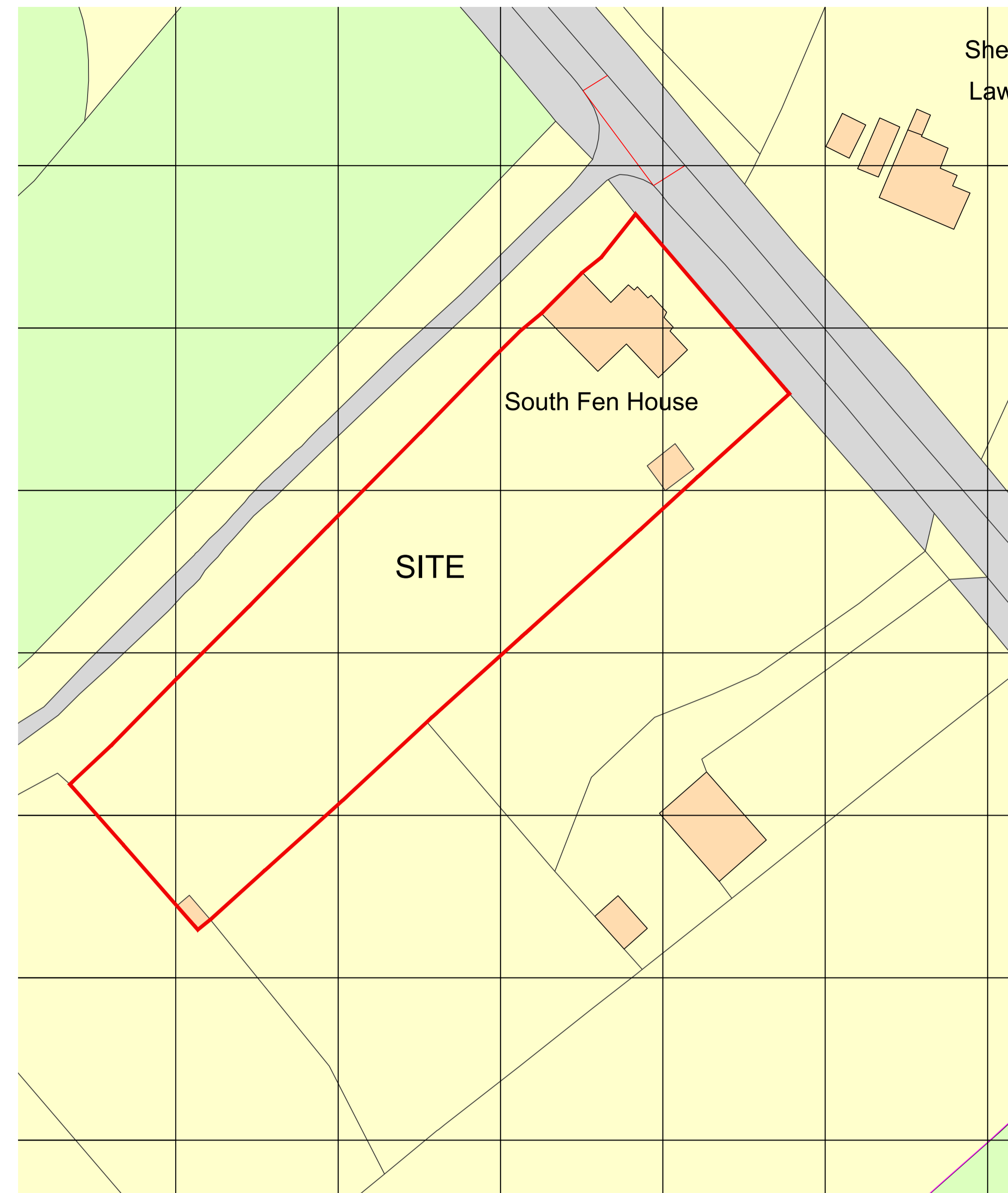
EXISTING BLOCK PLAN (BASED ON OS MAPPING DATA) SCALE 1:500 @A1