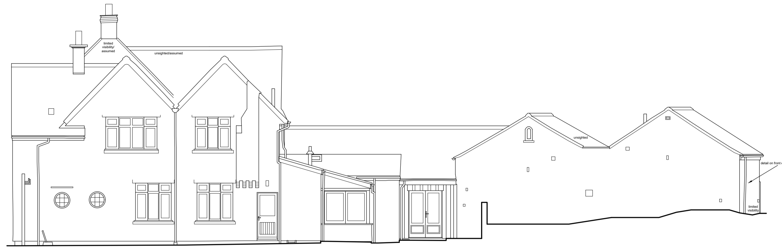
2 EAST ELEVATION SCALE - 1:100 @ A1