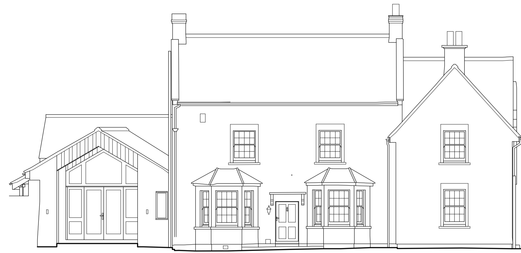
1 SOUTH ELEVATION SCALE - 1:100 @ A1