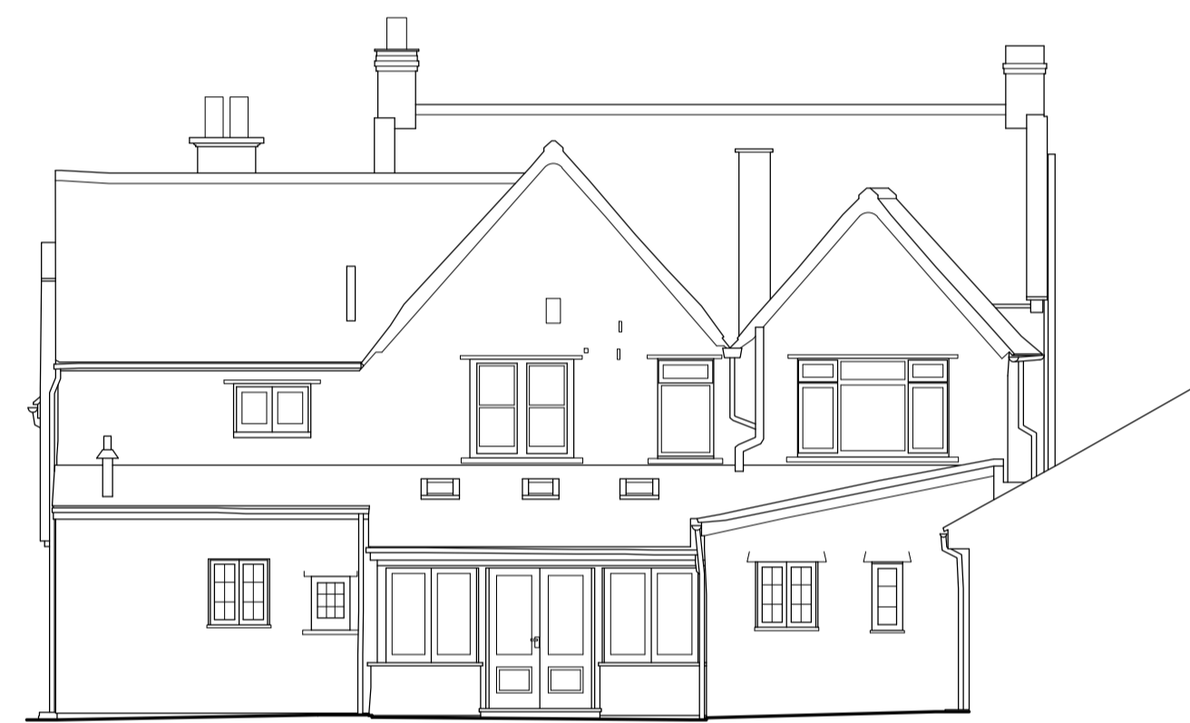
3 NORTH ELEVATION SCALE - 1:100 @ A1