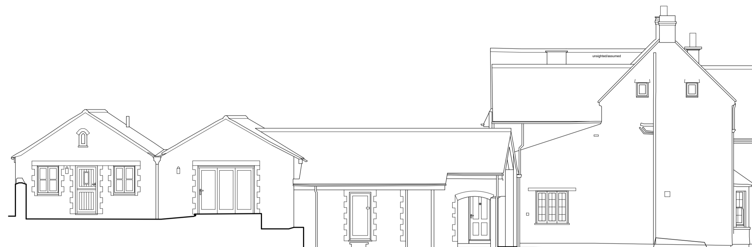
4 WEST ELEVATION SCALE - 1:100 @ A1