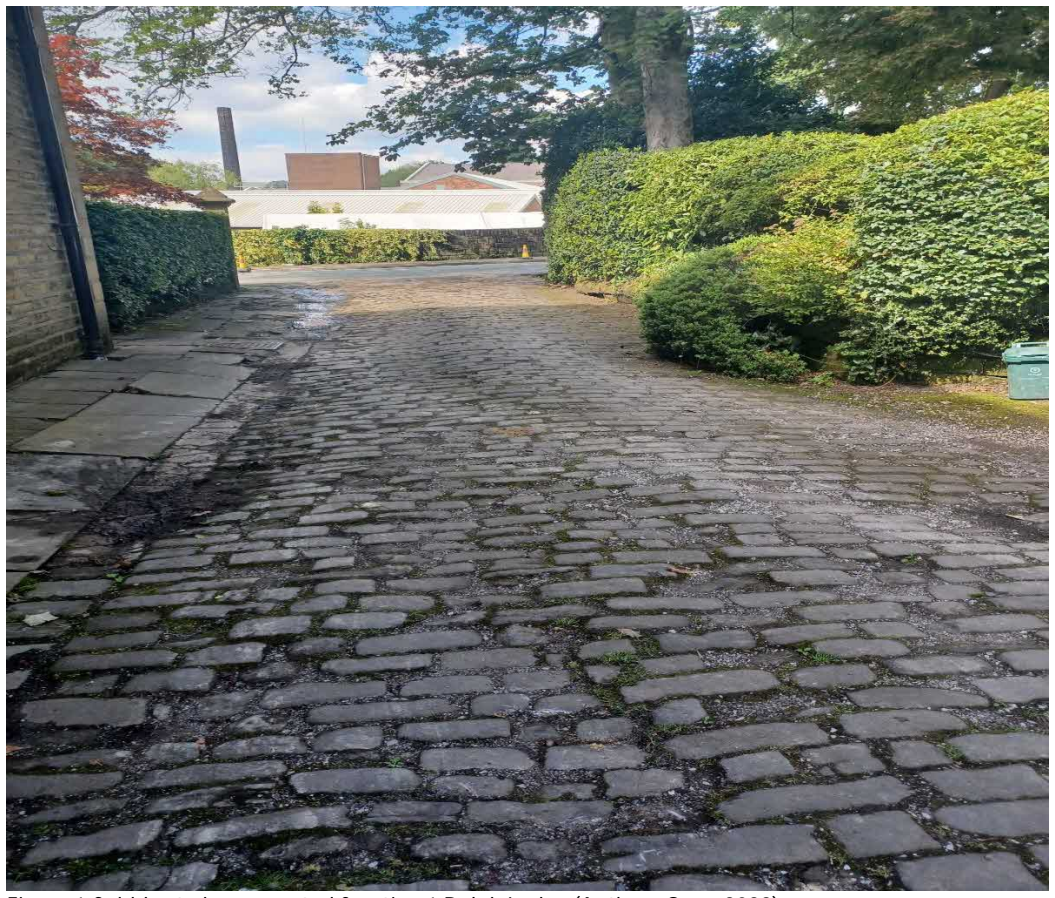
Figure 1 Cobbles to be excavated fronting 1 Delph Lodge