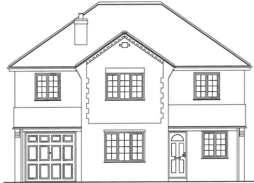
FRONT ELEVATIONS 1:100