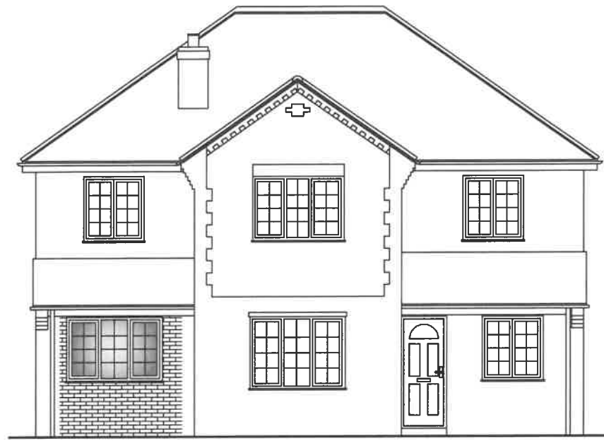
FRONT ELEVATIONS 1:100