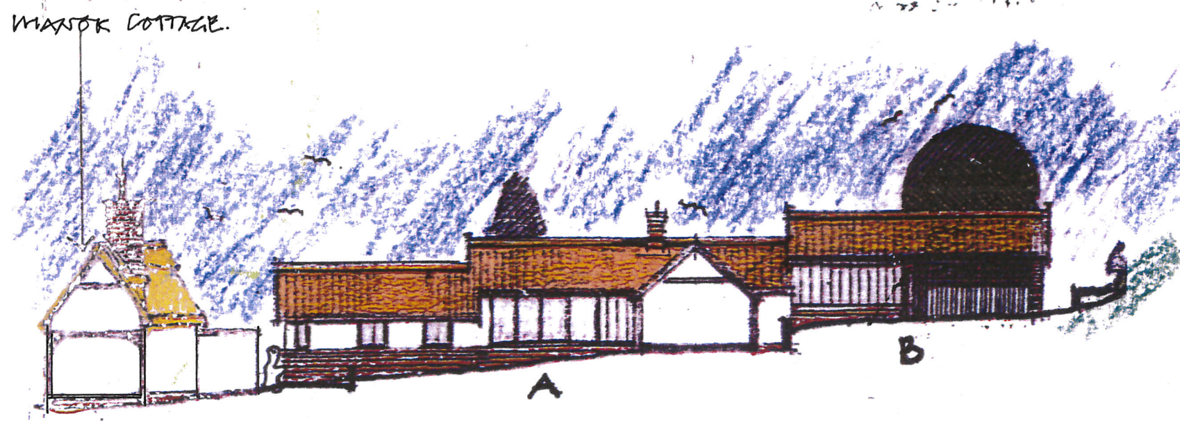
INNER COURTYARD ELEVATION: SECTION B-B.