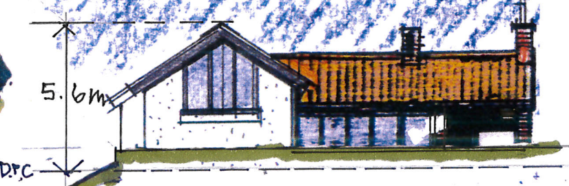
SECTION D-D ELEVATION.