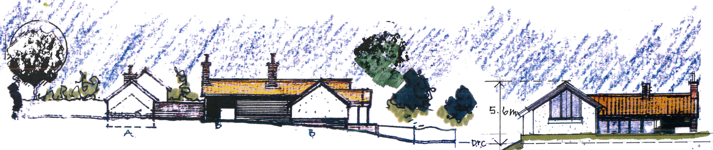
ELEVATION LOOKING NORTH: SECTION C-C.