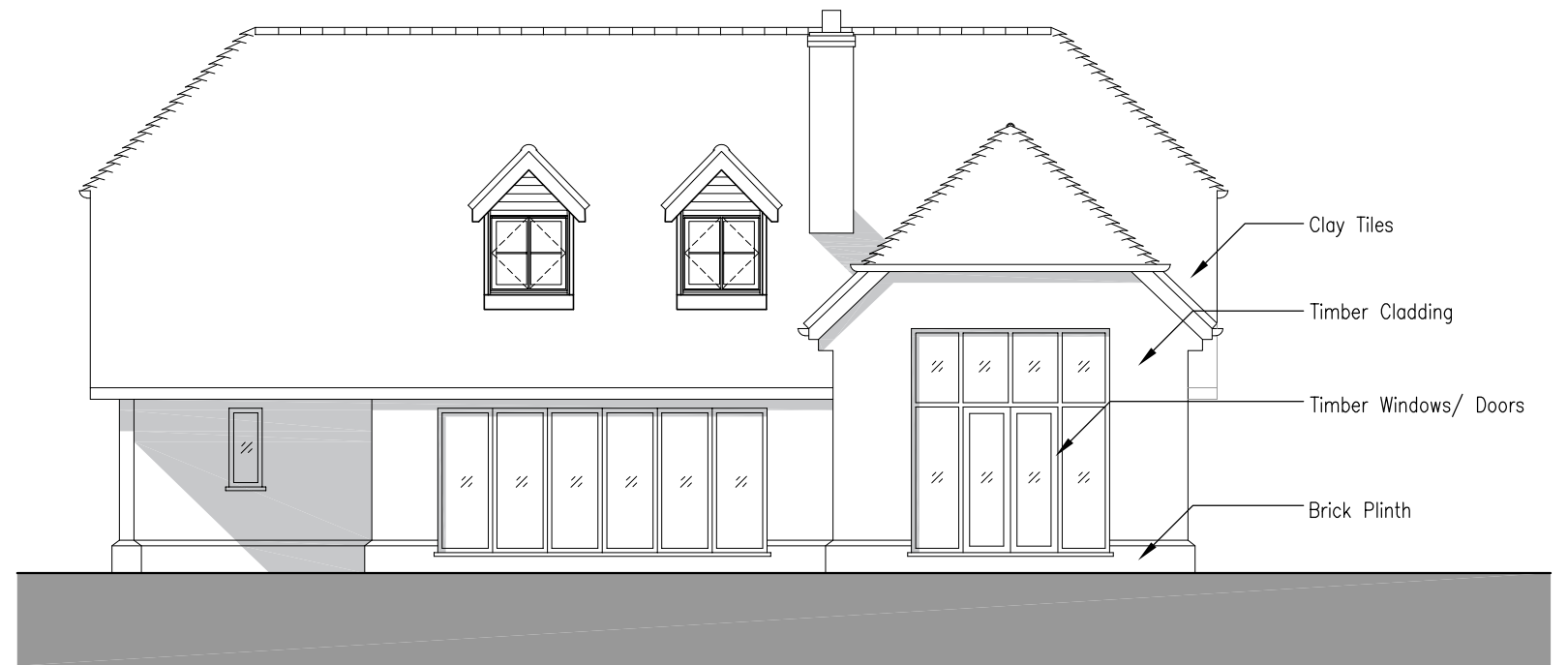
02 Proposed North Elevation 1:100