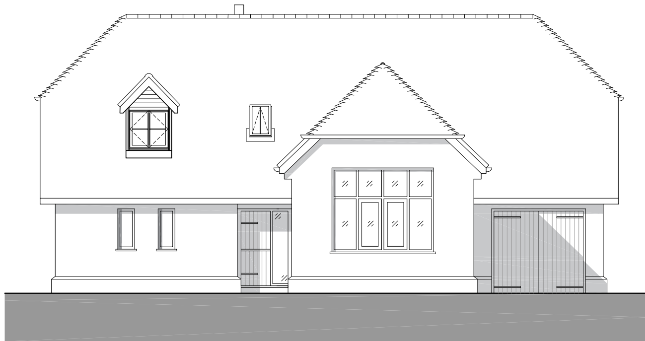
01 Proposed South Elevation 1:100