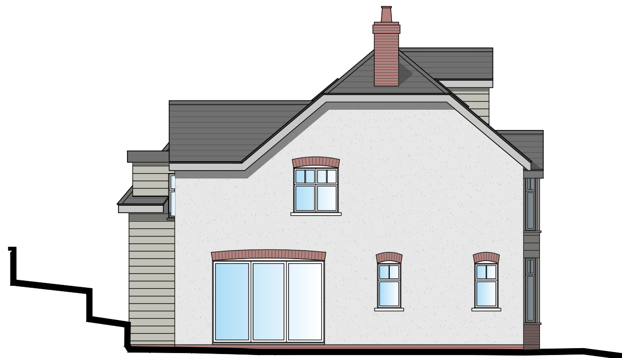
Side Elevation (West)