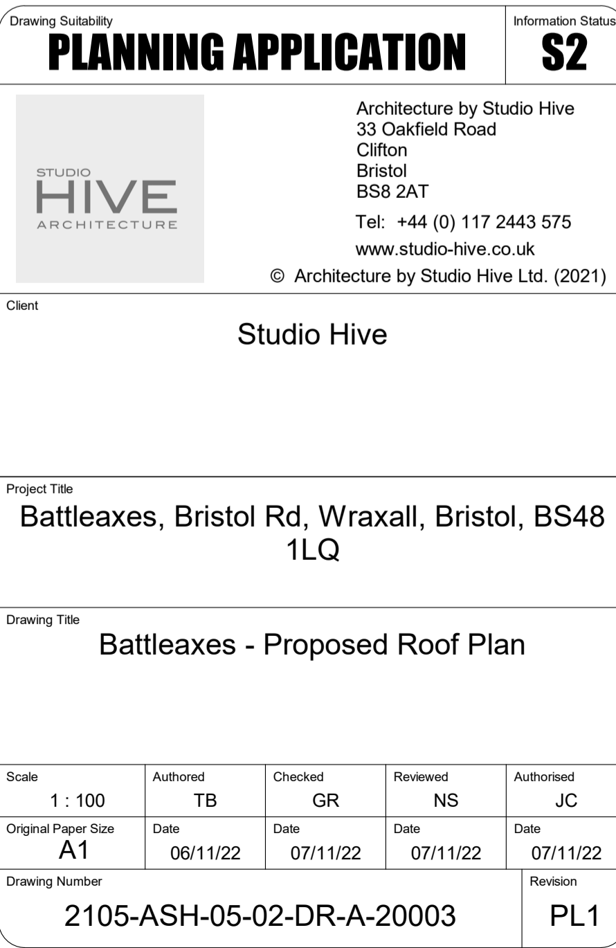
1 Proposed Roof Plan SCALE 1 : 100