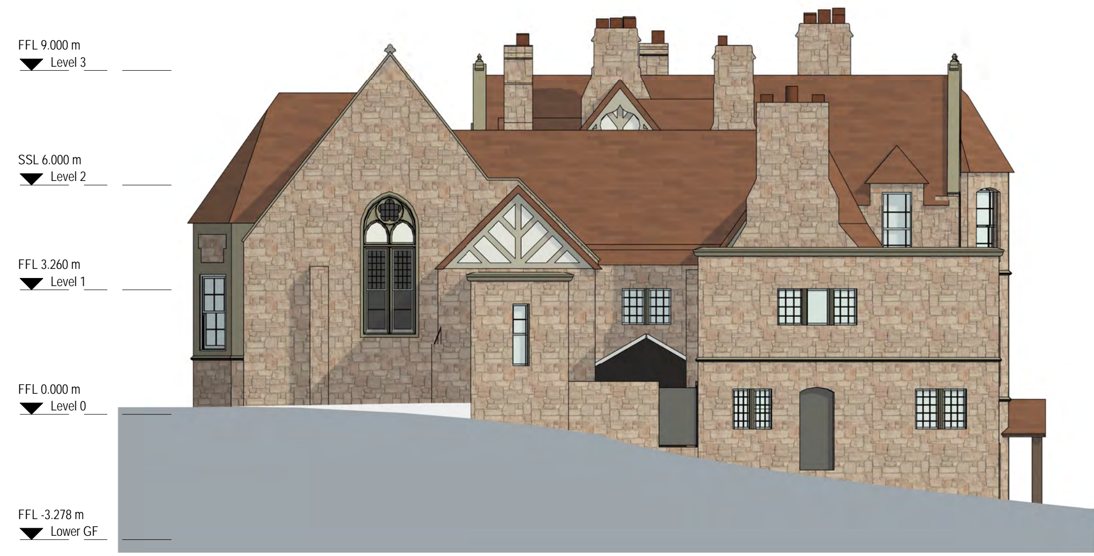
1 Proposed West Elevation SCALE 1 : 100

DO NOT SCALE FROM THIS DRAWING This document is subject to the terms of the contract between Client and Architecture by Studio Hive. This document is issued for the party which commissioned it and for specific purposes connected with the project detailed, only. It should not be relied upon by any other party, unless the intention is expressly stated in the contract, or used for any other purposes. We accept no responsibility for the consequences of this document being relied upon by any other party, or being used for any other purpose. This document contains confidential information and proprietary intellectual property. It should not be shown to other parties without consent from either Architecture by Studio Hive or from the party which commissioned it.