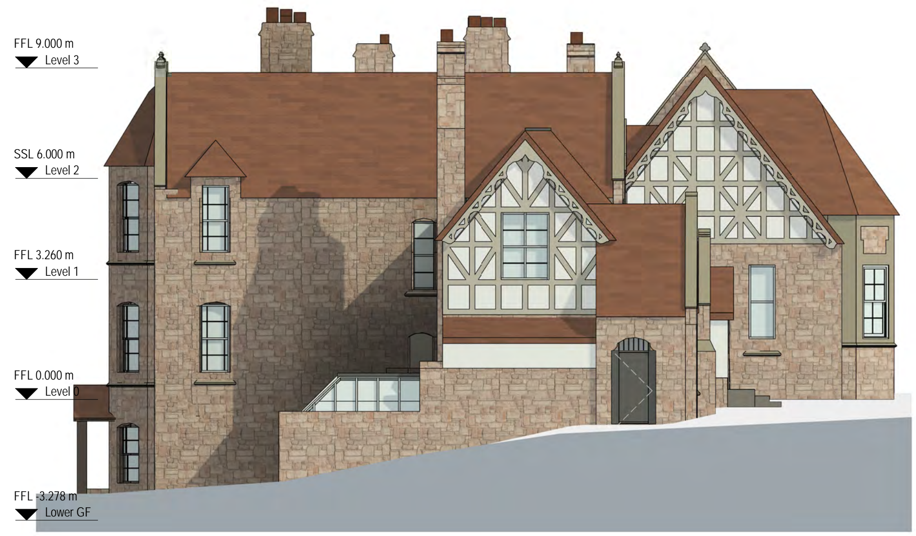
3 Proposed East Elevation SCALE 1 : 100