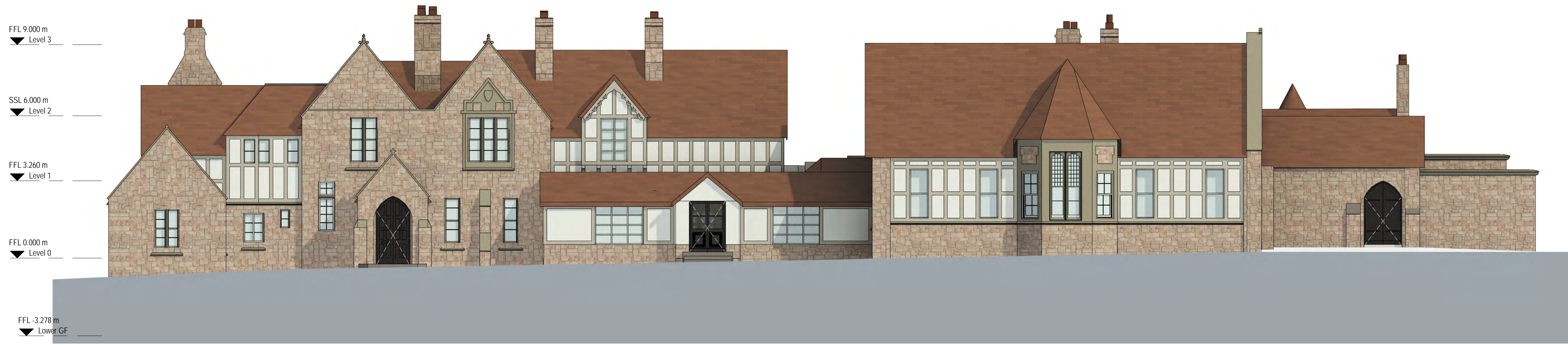
4 Proposed North Elevation SCALE 1 : 100