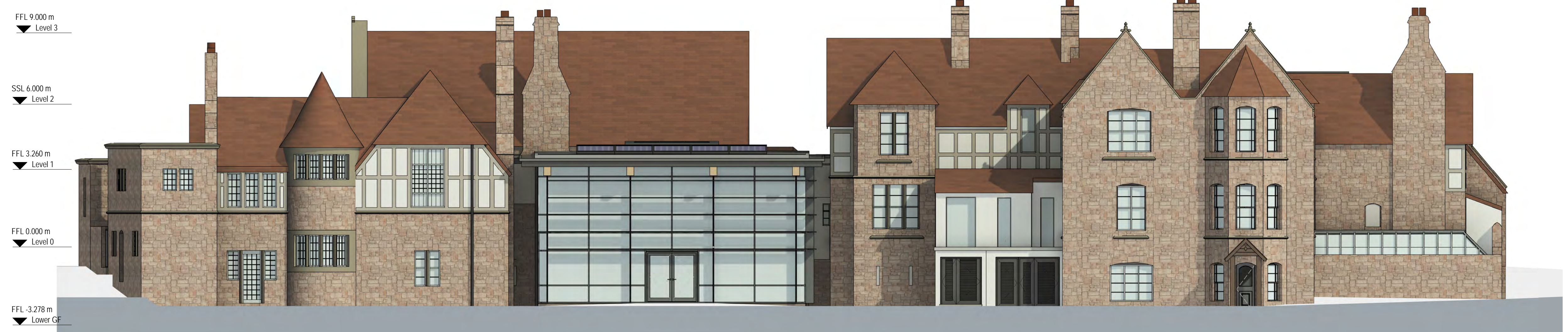
2 Proposed South Elevation SCALE 1 : 100