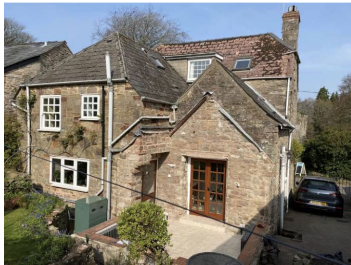
Image illustrating the current condition at the rear of Moat House. Image taken during the construction of the rear ground floor and roof dormer extension (P1003/21/FUL & P1004/21/LBC)