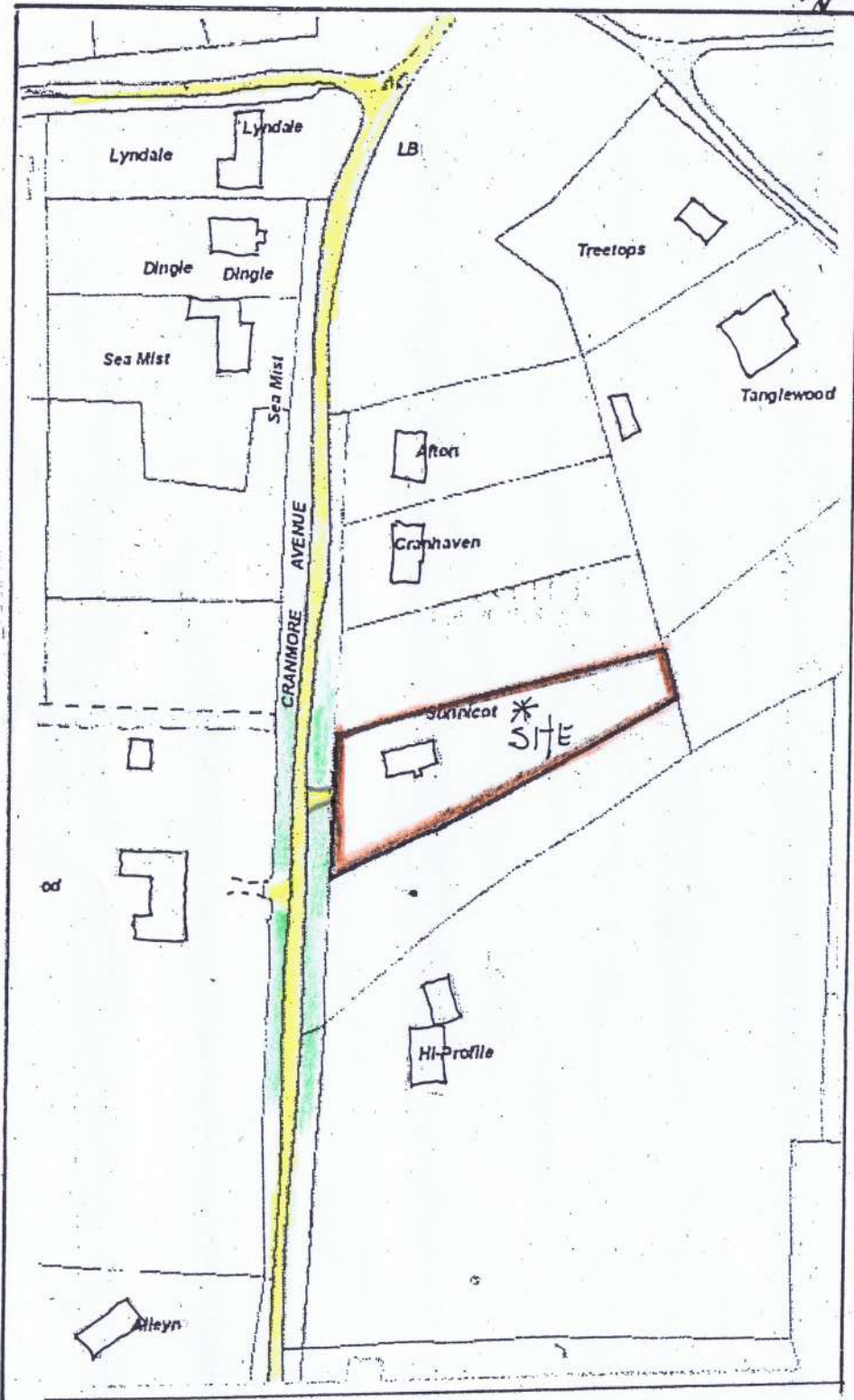
1:1250 LOCATION PLAN