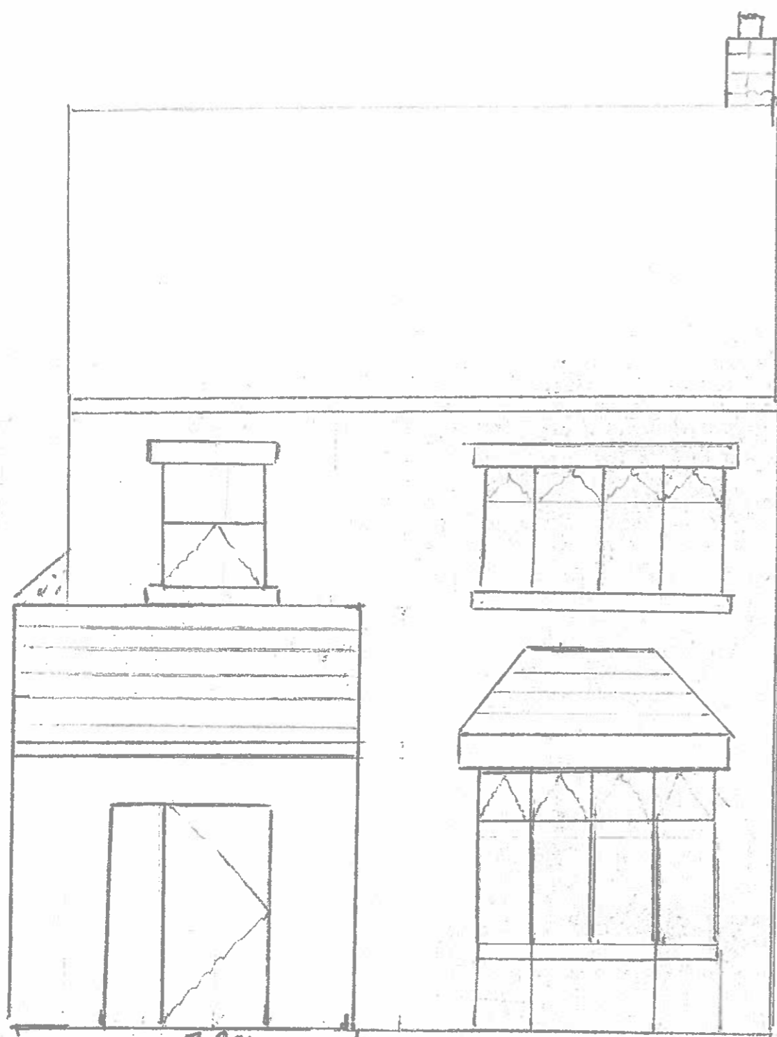
3.206 EXISTING REAR ELEVATION