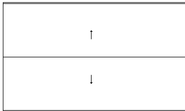
existing roof plan scale 1:200