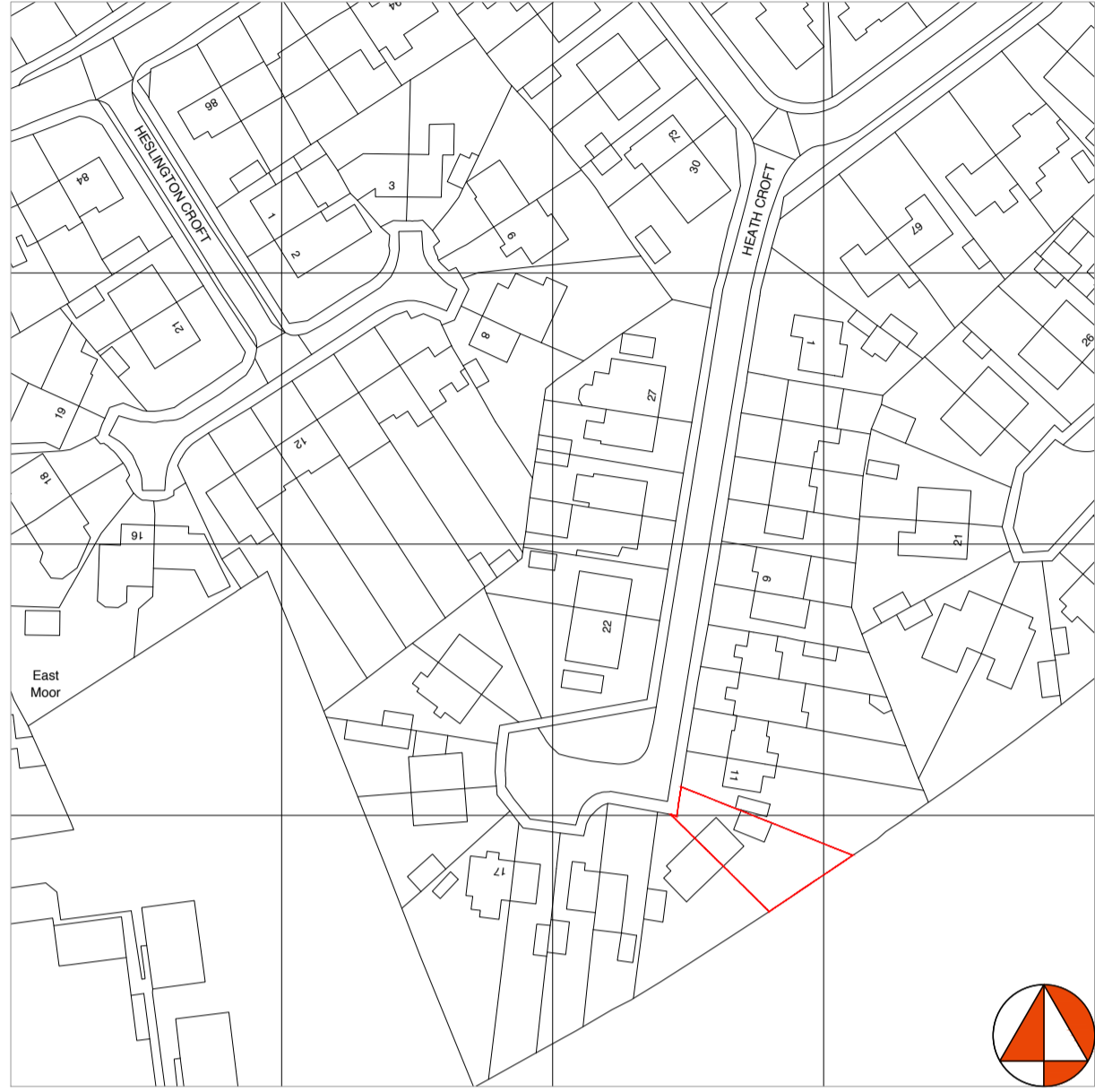
SITE PLAN (1:1250)