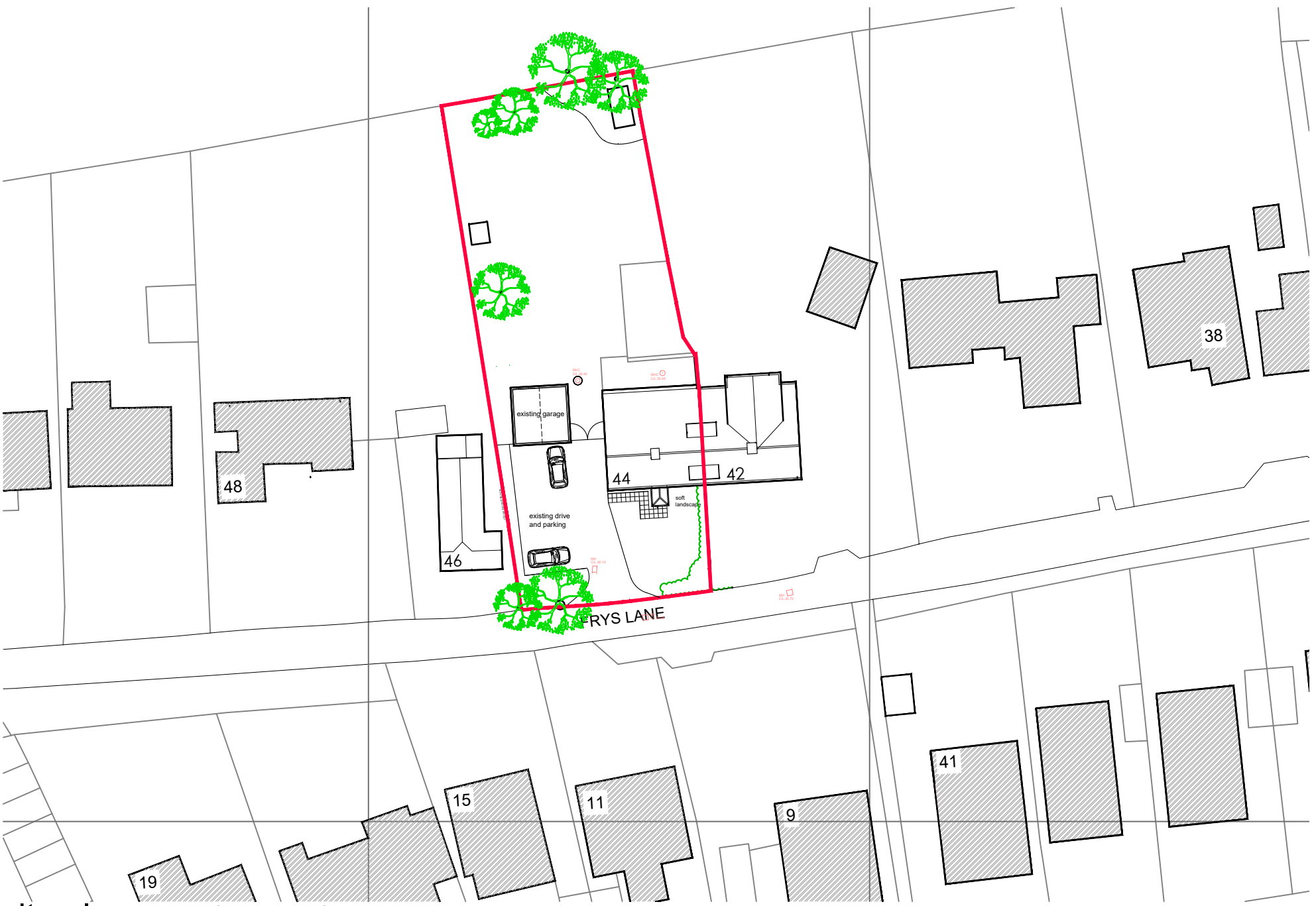
site plan Scale 1:500