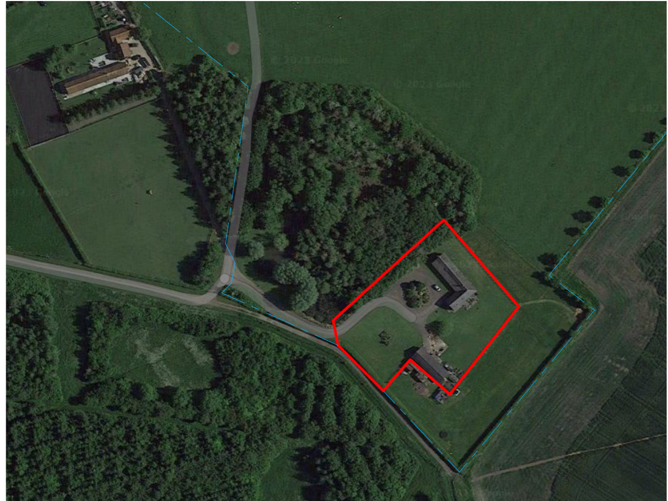
Aerial View NOT TO SCALE