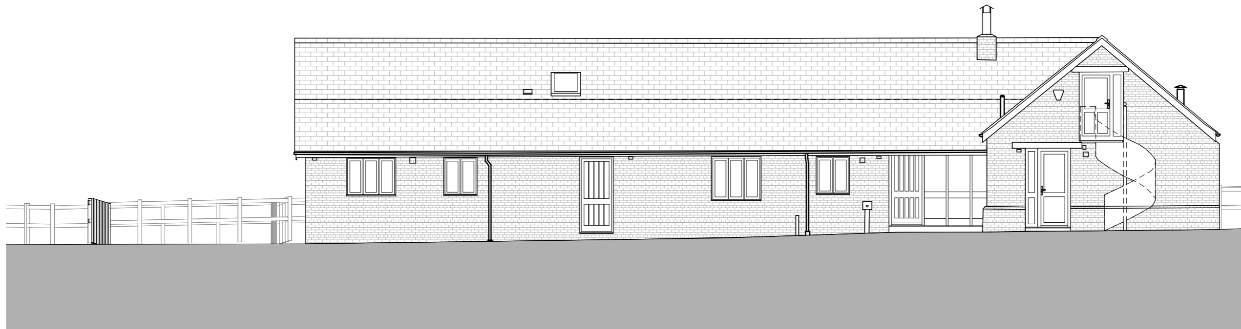
South West Elevation 1:100