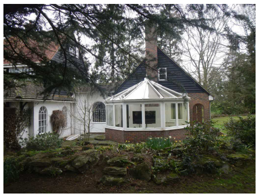
extension and link