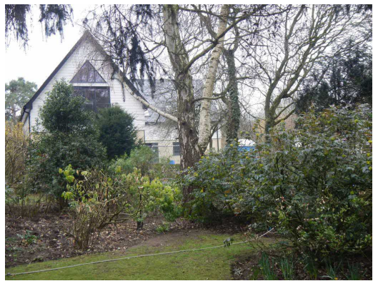
27. View from the east side of the house looking South towards the rear boundary and the property abutting to the South (Magdalens)