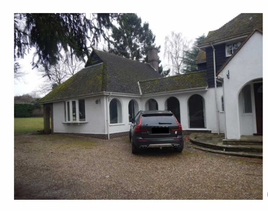
6. East end of North elevation