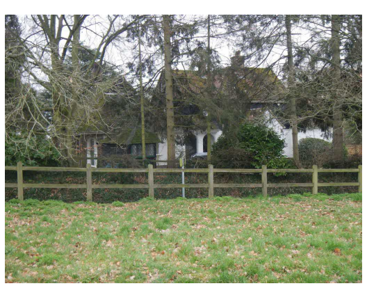
24. View towards site from churchyard