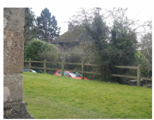
20. View towards site from churchyard