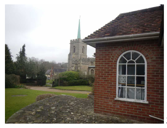
26. View of church from South West corner of house