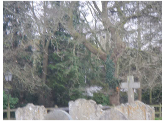
25. View towards site from churchyard