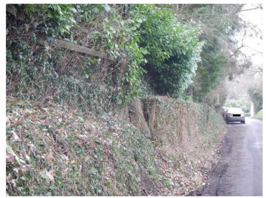
17. Boundary to North side from road