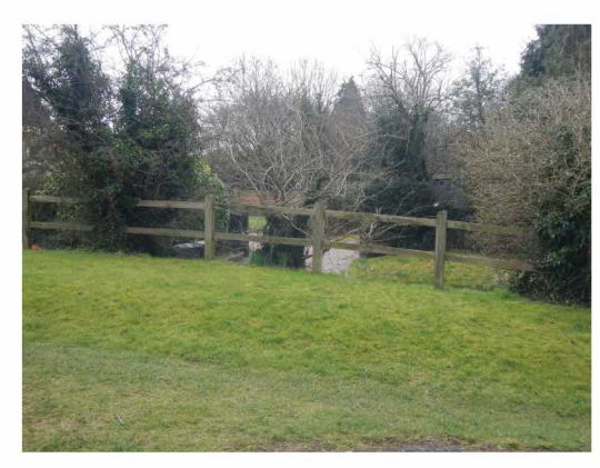
19. View towards site from churchyard