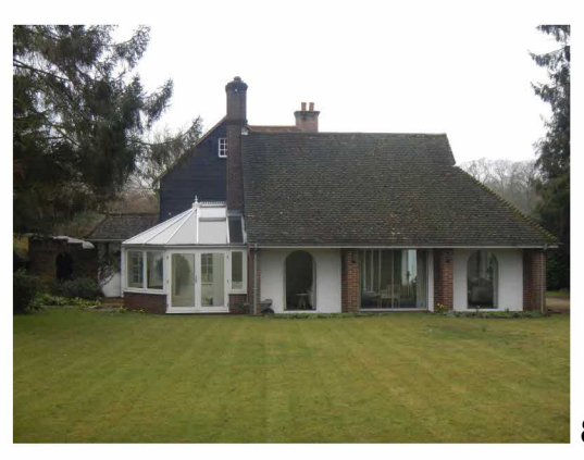
8. East elevation