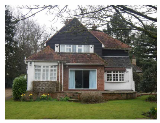
11. West elevation