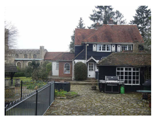
14. South elevation and view of church from site