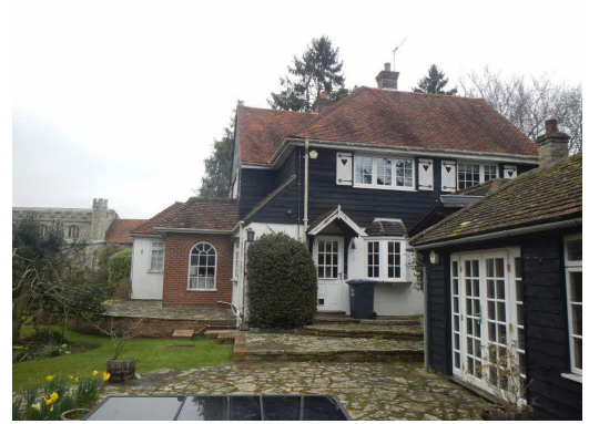
13. South elevation