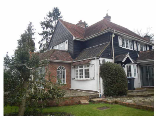
12. West and South elevations