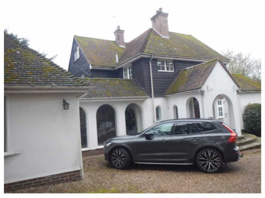
and link sections