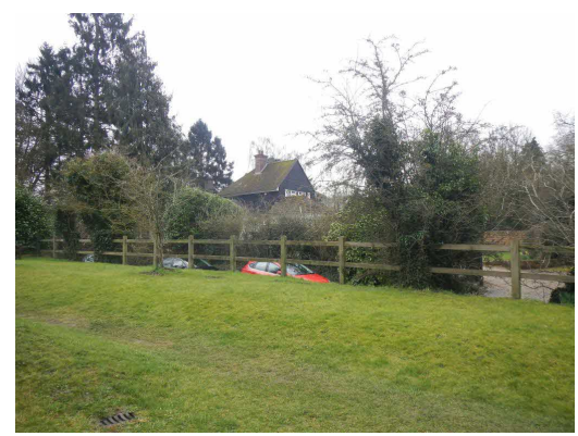
21. View towards site from churchyard