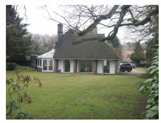
9. East elevation