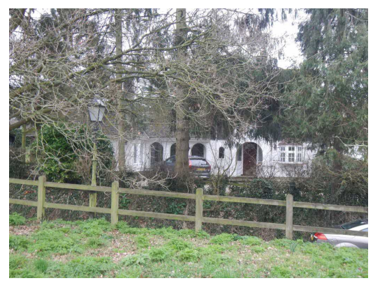
23. View towards site from churchyard