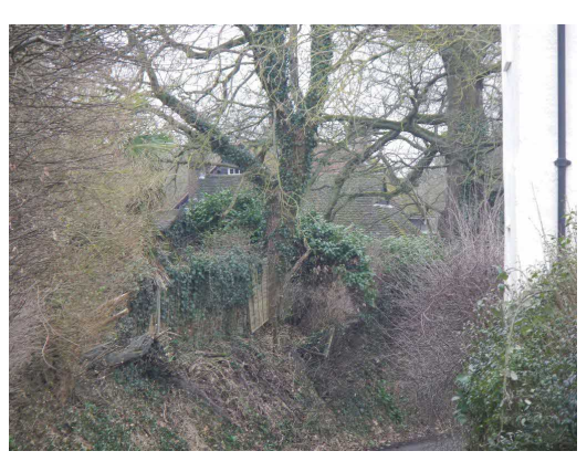
16. Boundary to North side from road