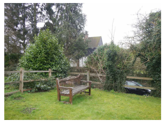
22. View towards site from churchyard