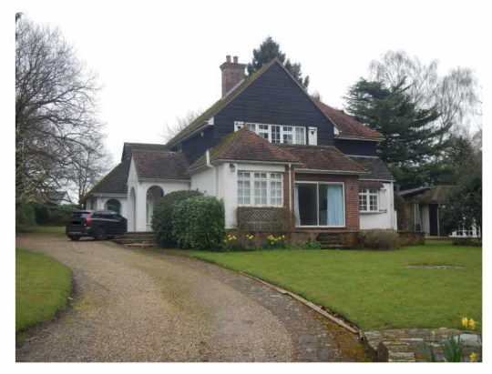
10. West elevation from site access