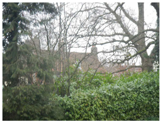
end of the site