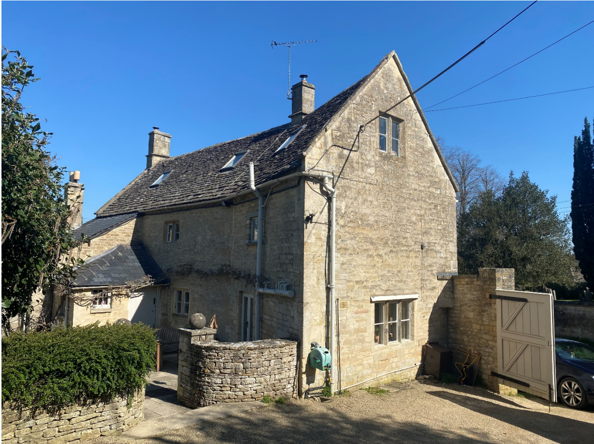
Gable End and rear from the courtyard