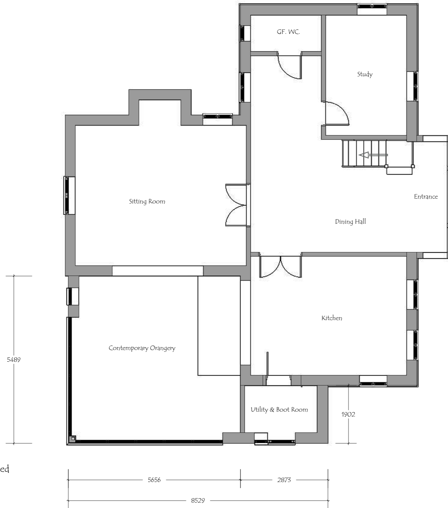
Ground Floor Plan - Proposed