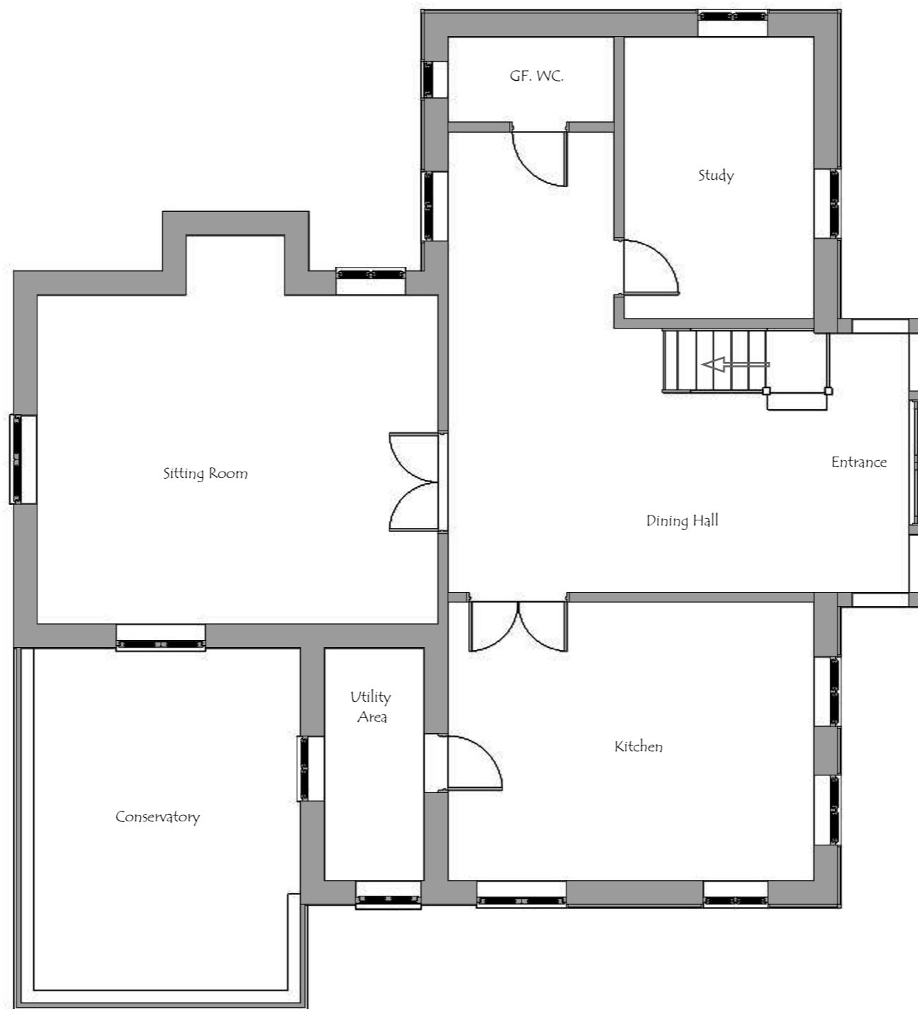
Ground Floor Plan - Existing