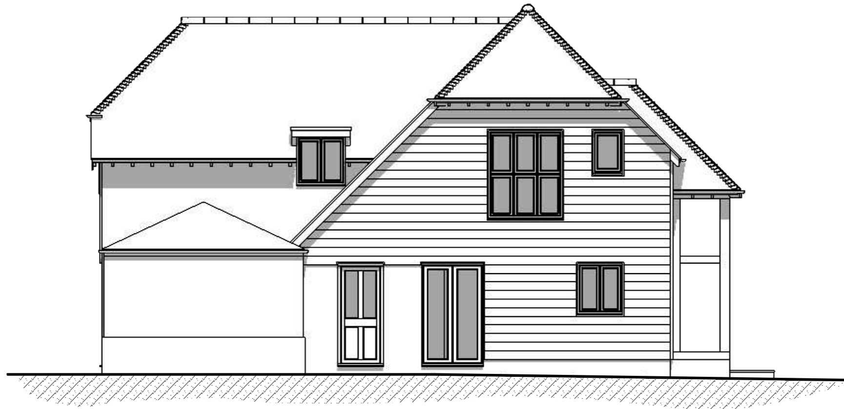
South Elevation - Existing