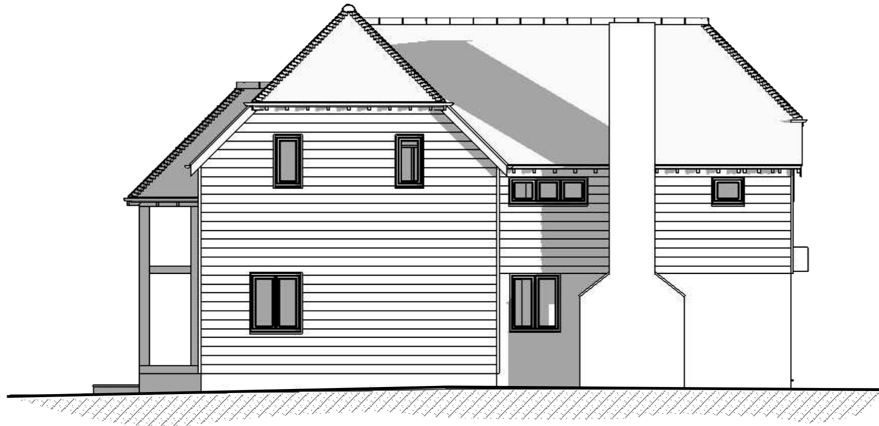
North Elevation - Existing