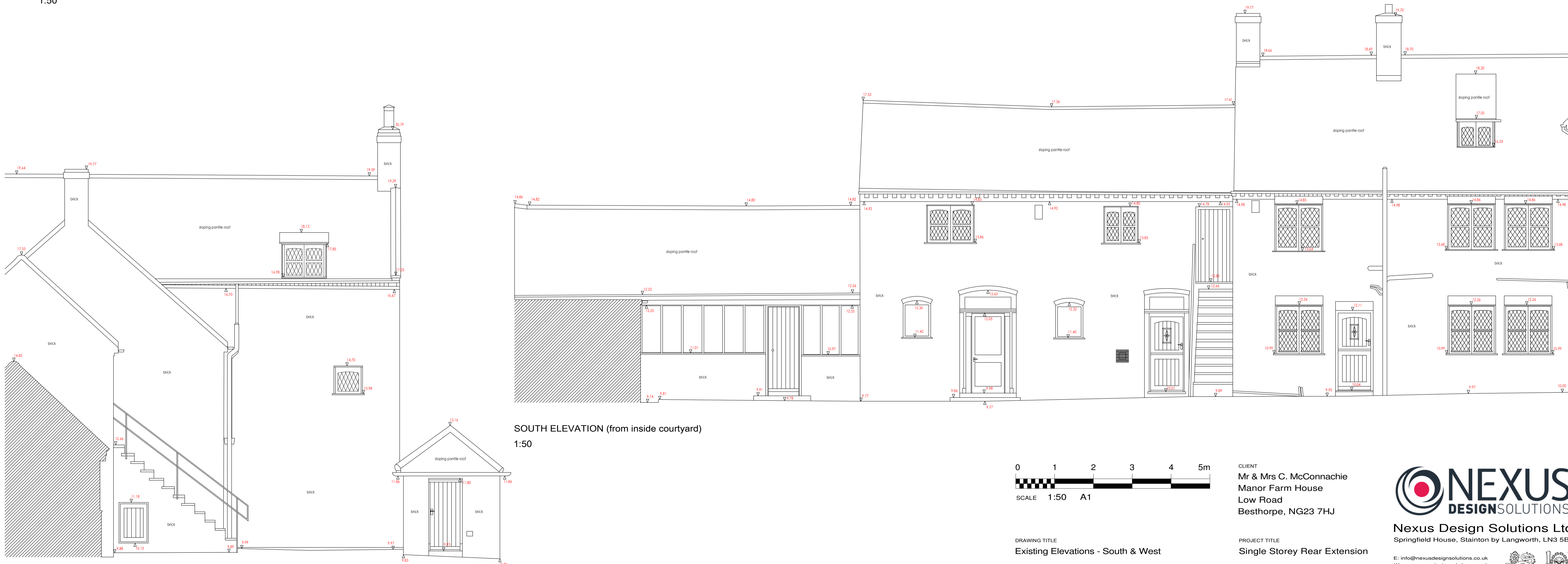
WEST ELEVATION 1:50