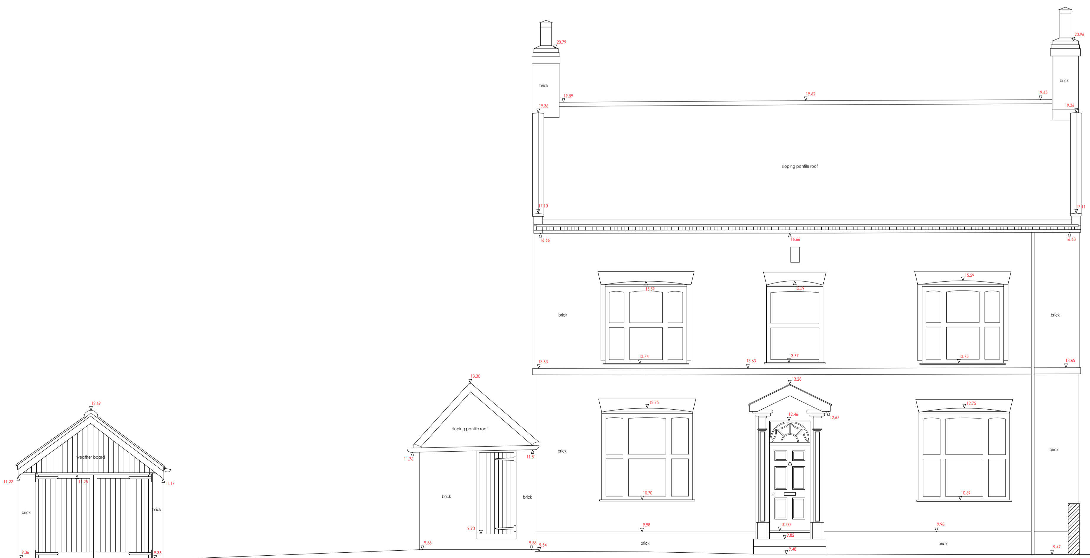
EAST ELEVATION 1:50