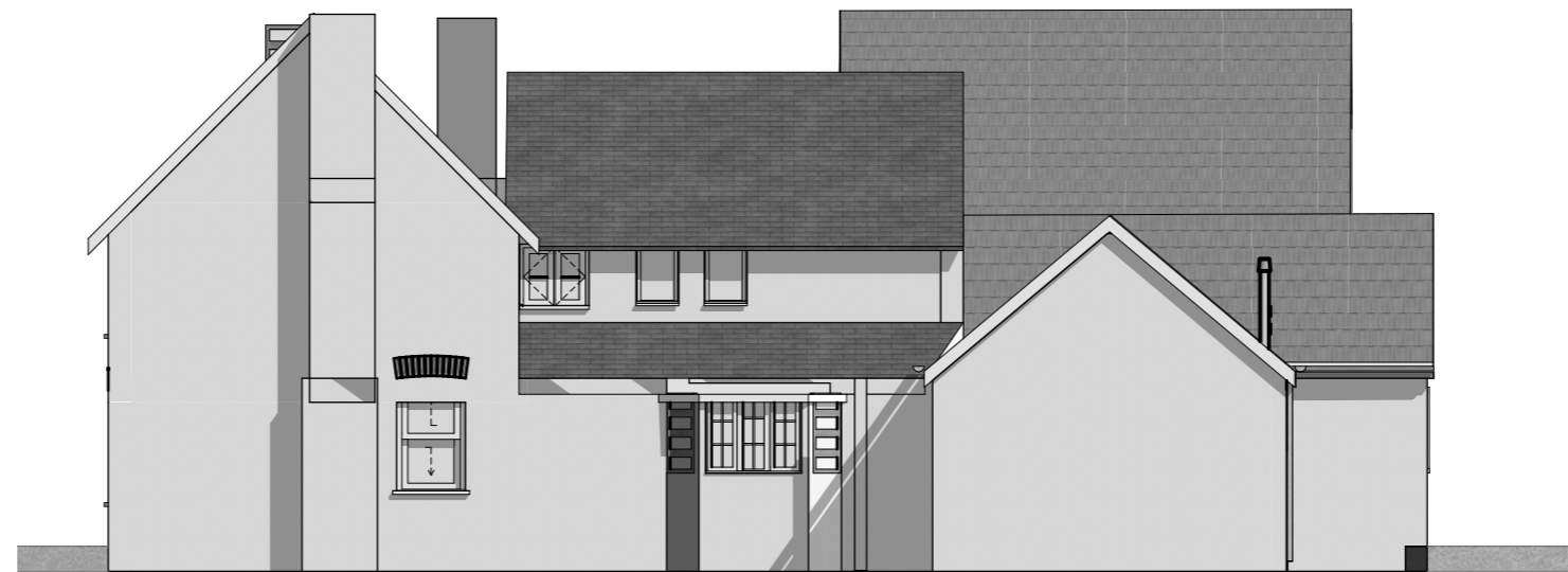
1:100 Existing North West Elevation