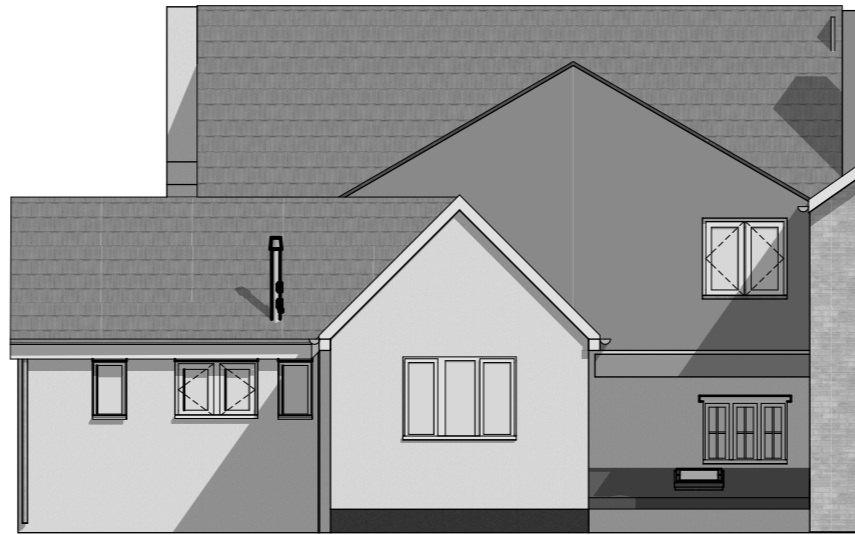
1:100 Existing South West Elevation