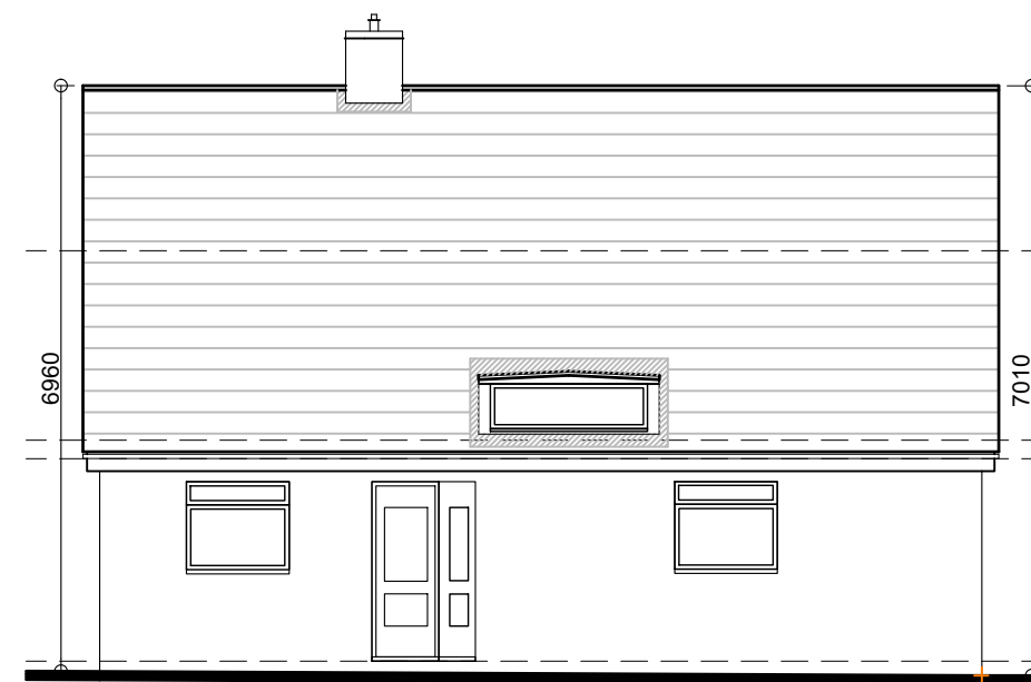
Existing Side Elevation - View B