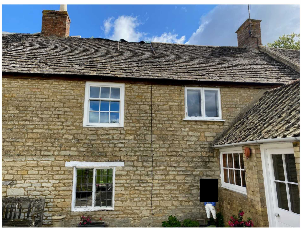
Fig 7 First floor sash and casement windows to be replaced with leaded windows to match original cottages