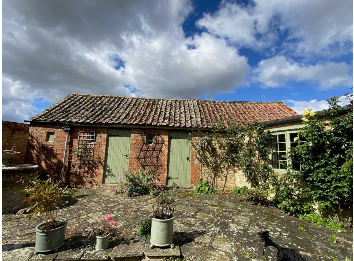
Fig 3 Brick elements of south wing to be rebuilt forming larger window apertures