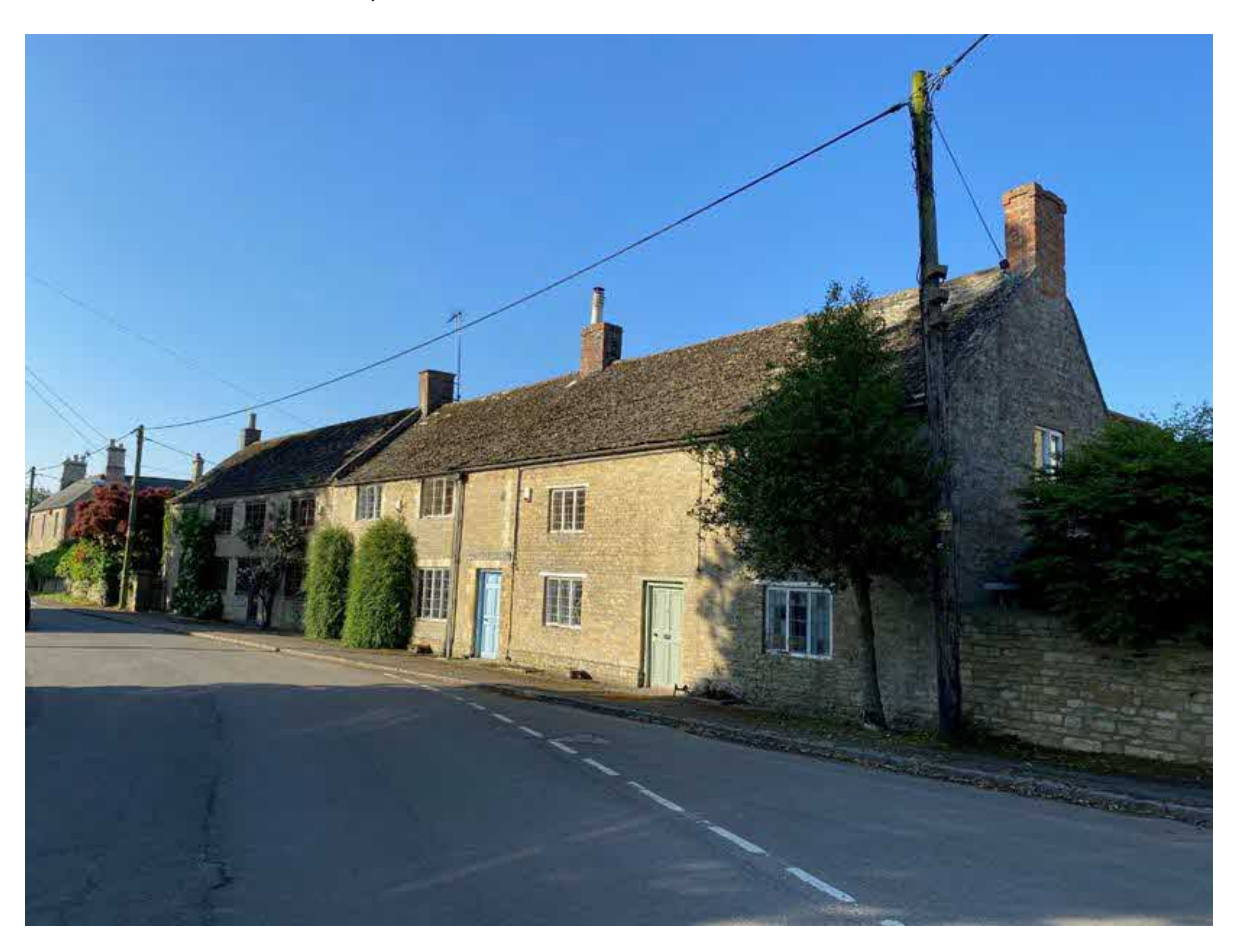
Fig 1 View of property from Min Street, with No 61 in the foreground

The three cottages (now one dwelling) are accessed directly off Main Street. The main pedestrian access is through No 57 with a secondary service access to No 61 (green door). The central (blue) doorway, that to No 59, has been sealed up internally and no longer provides access to the property.