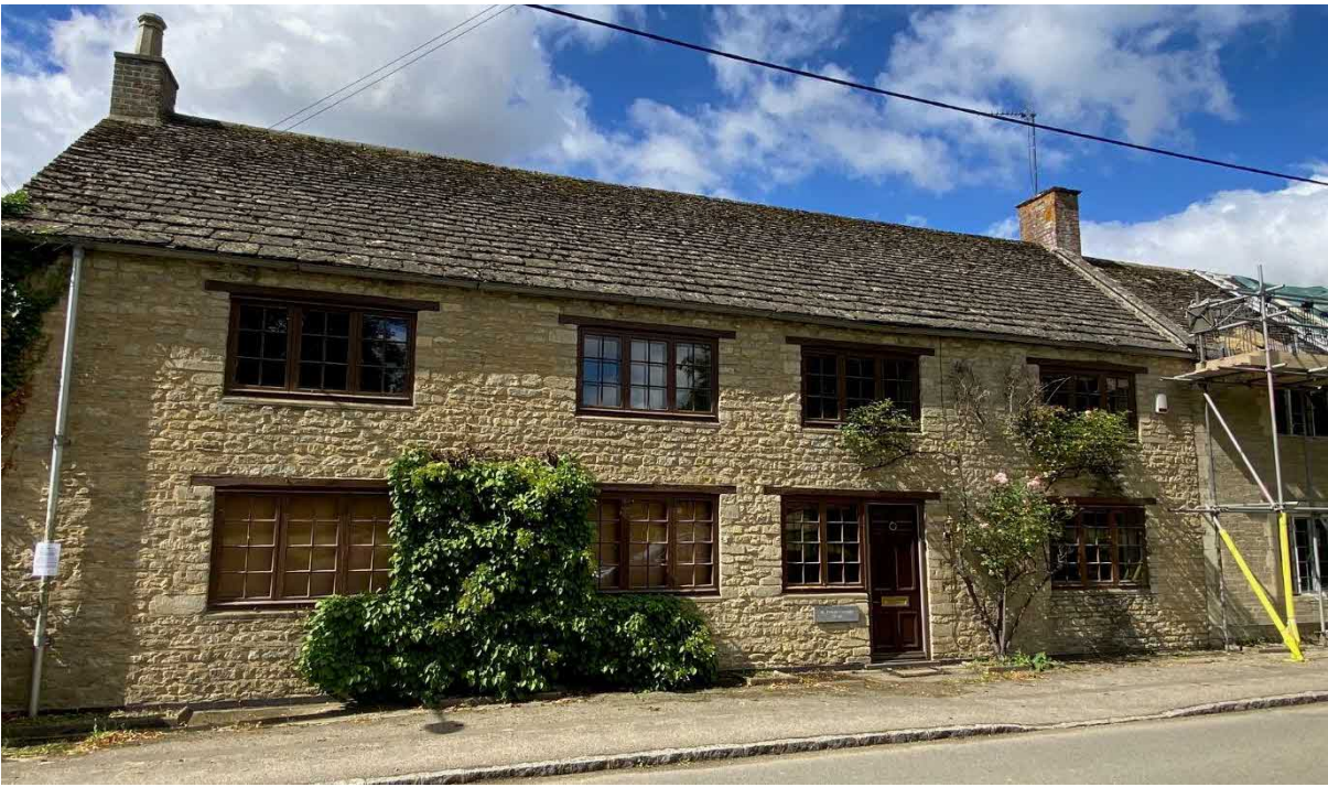
Fig 5 Current dark stained single glazed windows in "newer" cottage to be replaced

Other external changes relate to the window fenestration. It is the intention to replace the windows in the newer cottage to match the original cottages as well as two other first floor widow anomalies to the first floor rear. This will provide a uniform fenestration pattern in keeping with the original cottages.