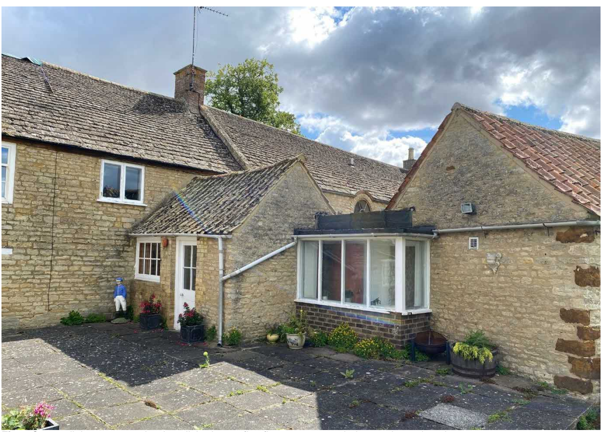
Fig 4 Current link structure to be demolished, note first floor casement windows to be replaced