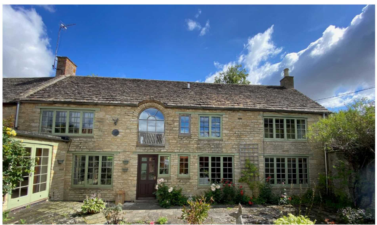
Fig 8 Rear windows of "nweer" cottage to be replaced, smaller livingroom window to be adpted to doors to provide direct access into courtyard space

There are some minor internal amendments indicated on proposed floor plan drawings 23 680 PL05 & PL06 primarily concerning the "newer" cottage.