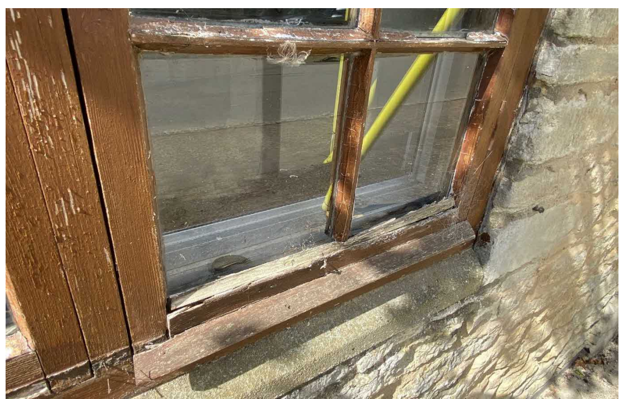
Fig 6 Poor condition of exisitng dark stained single glazed windows in "newer" cottage