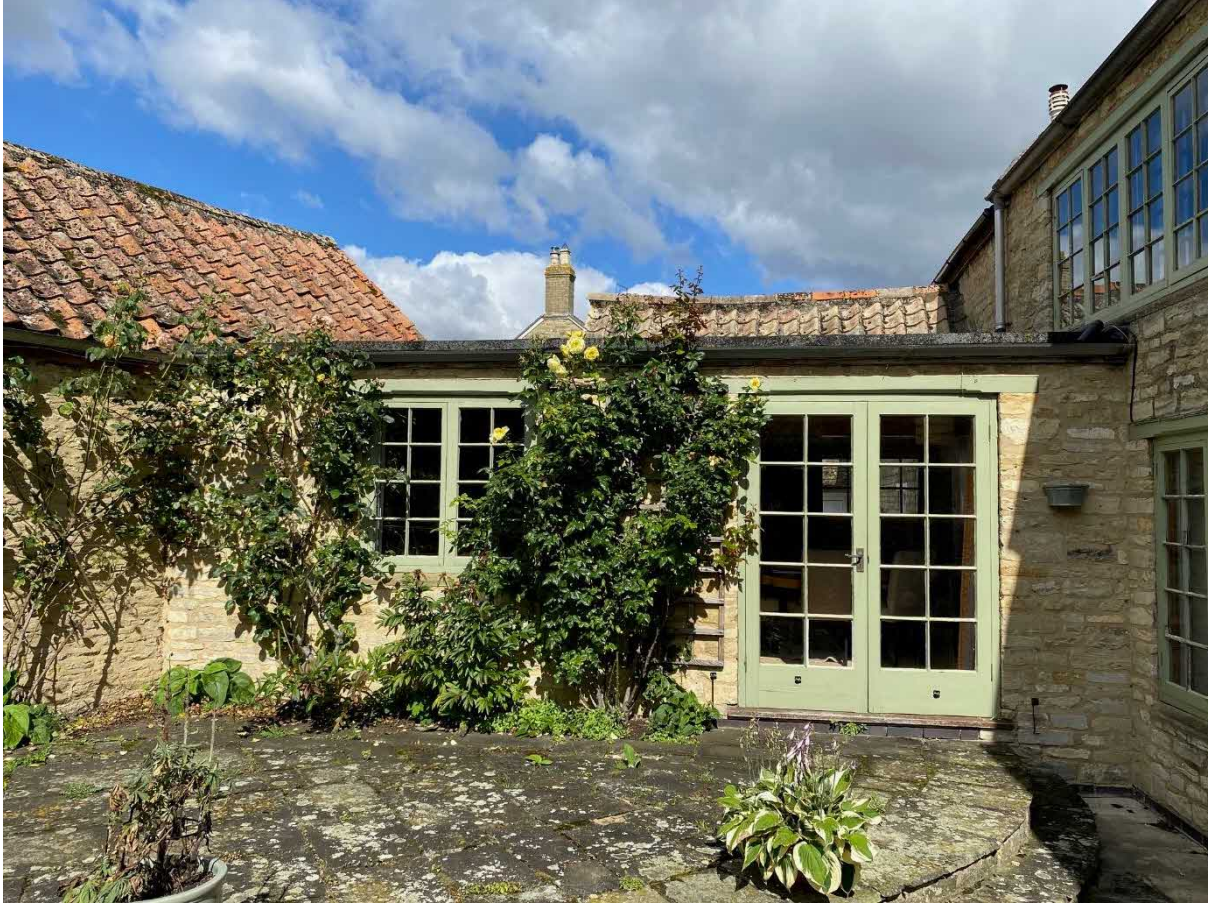
Fig 5 Current link structure to be demolished/rebuilt