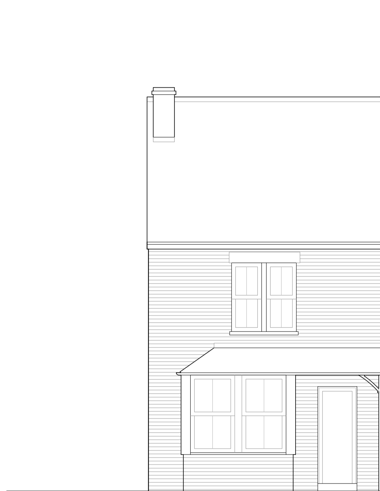
Existing Front Elevation Scale 1:50