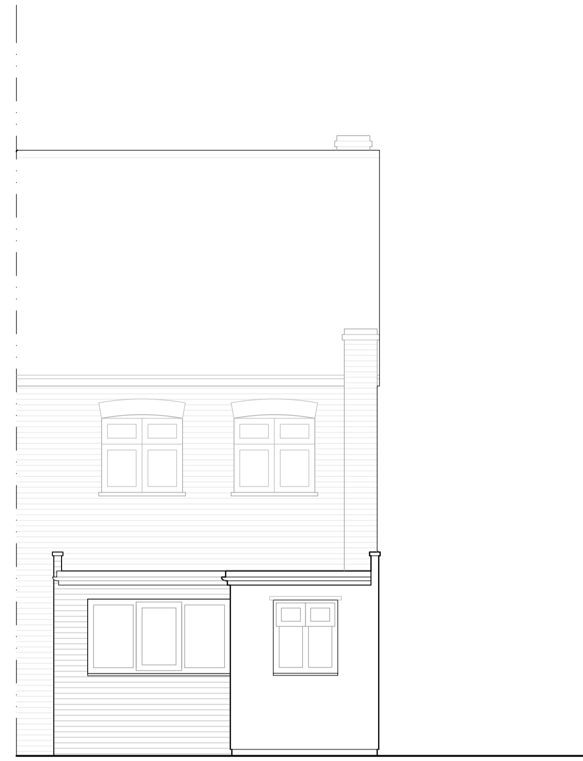
Existing Rear Elevation Scale 1:50