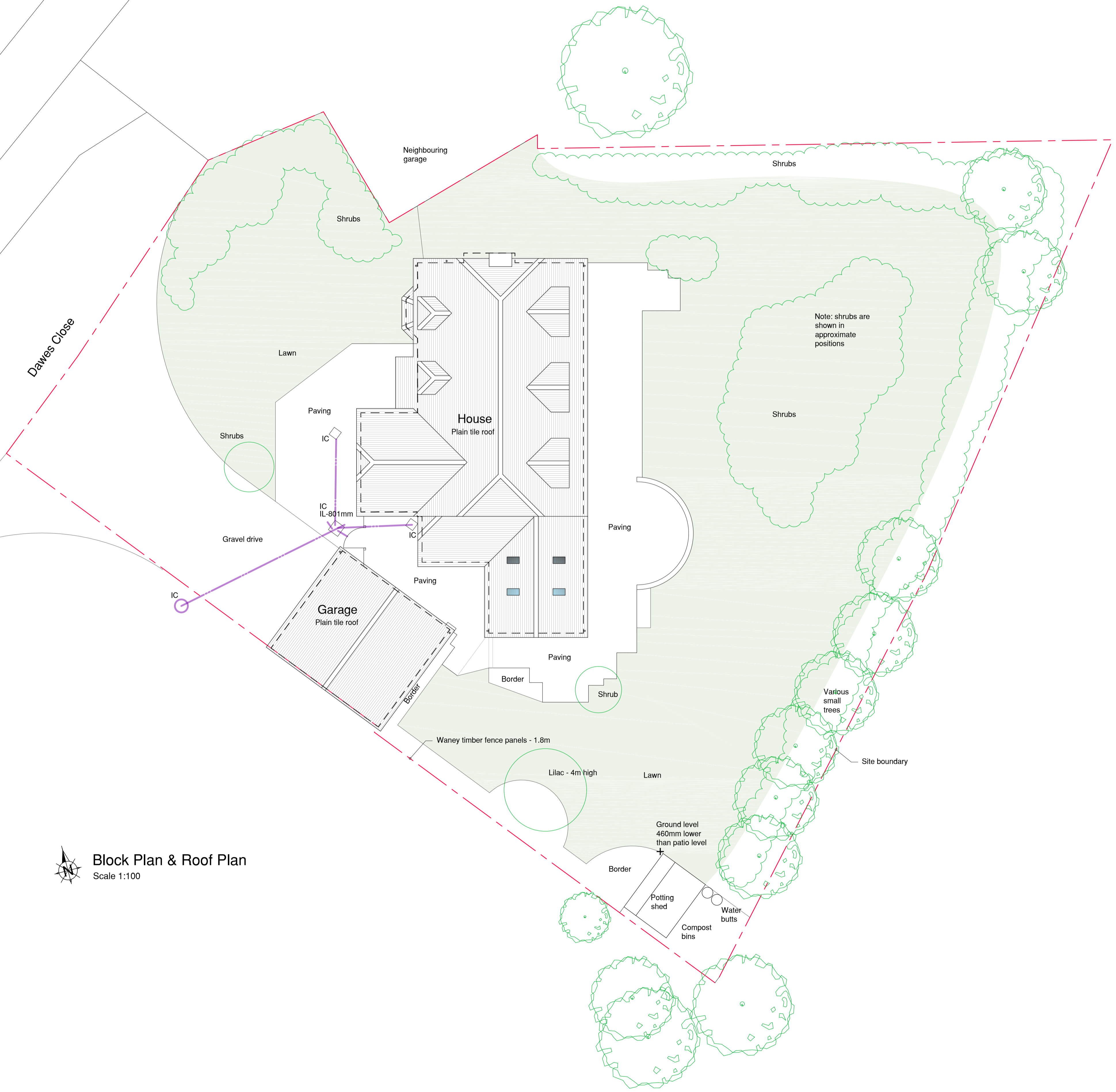
Block Plan & Roof Plan Scale 1:100