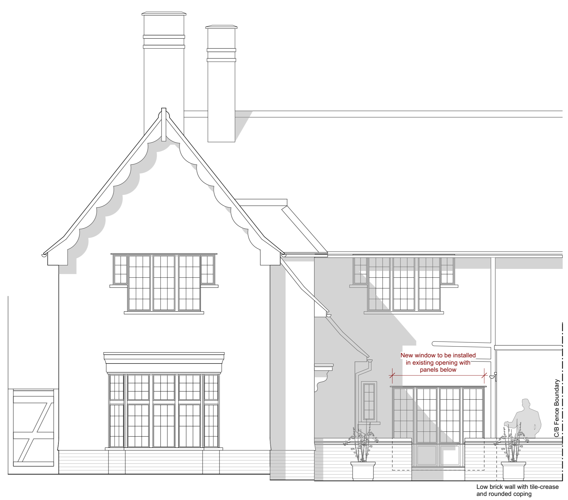
Drafting Datum 9.0m Proposed Front Elevation Scale 1:50 @ A1