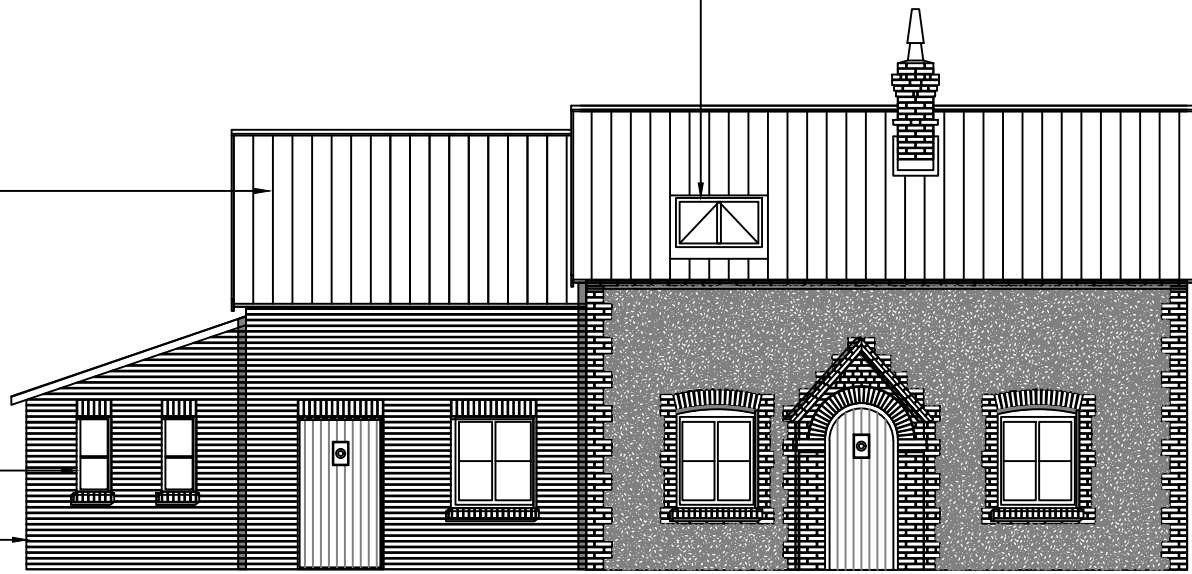
01 NORTH ELEVATION 1:100 001 COURT FARM COTTAGE