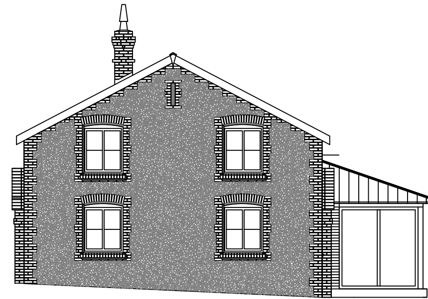
02 WEST ELEVATION 1:100 001 COURT FARM COTTAGE