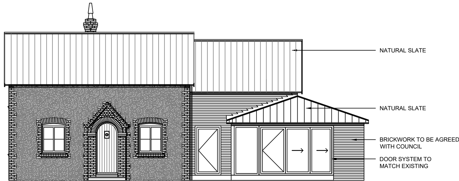
03 SOUTH ELEVATION 1:100 001 COURT FARM COTTAGE