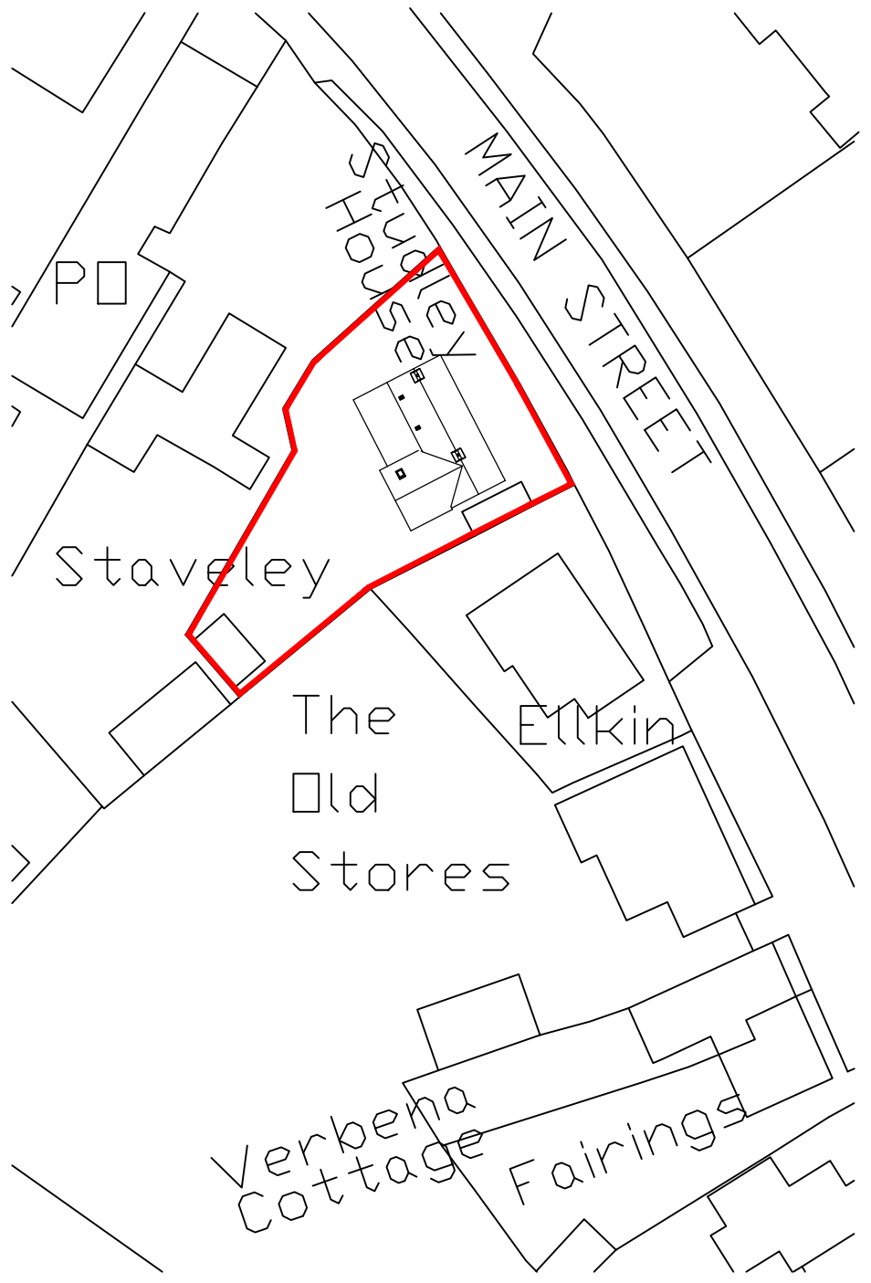
Existing Block Plan 1:500