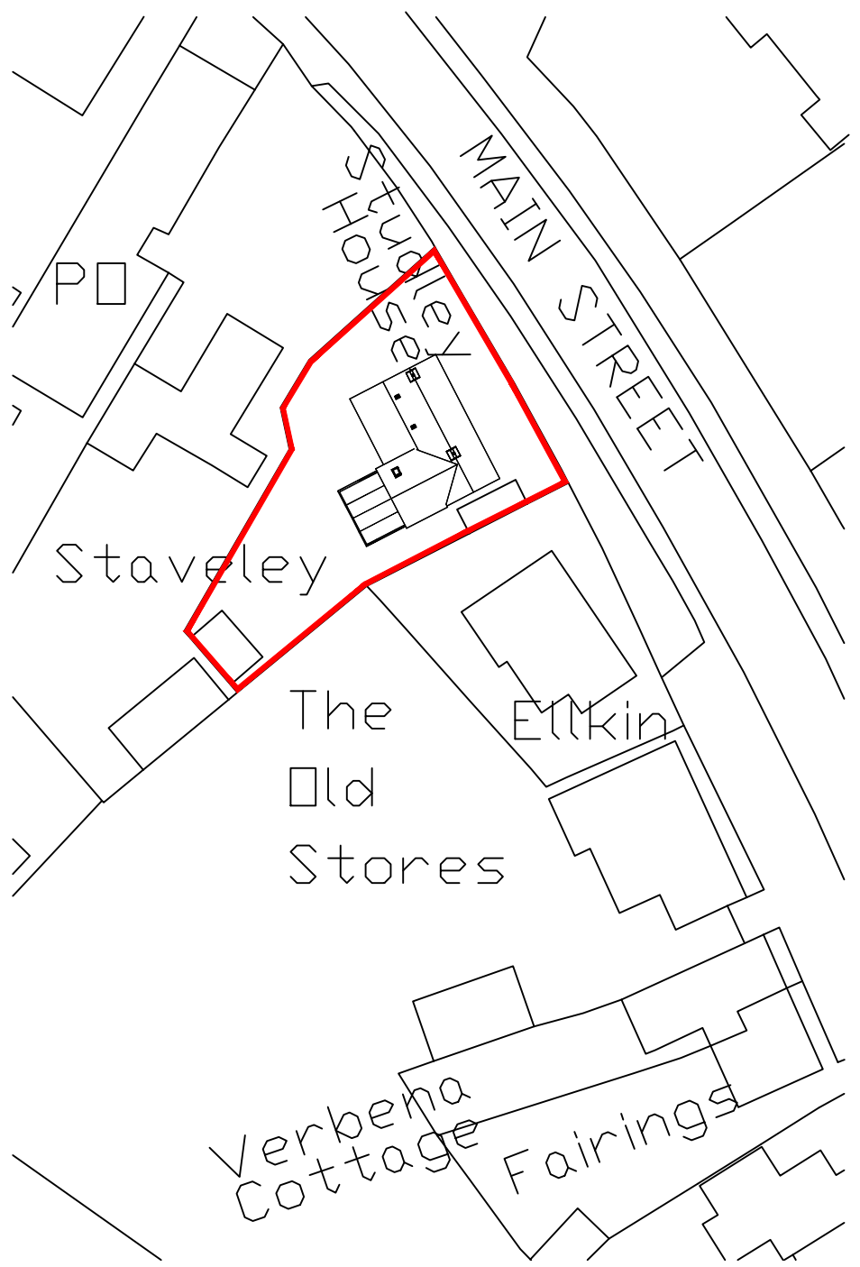
Proposed Block Plan 1:500