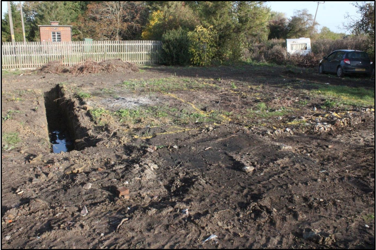
Plate 1 General view of area facing north east