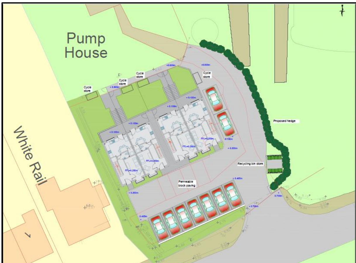
Figure 1 Proposed development plan (EZ Plans)