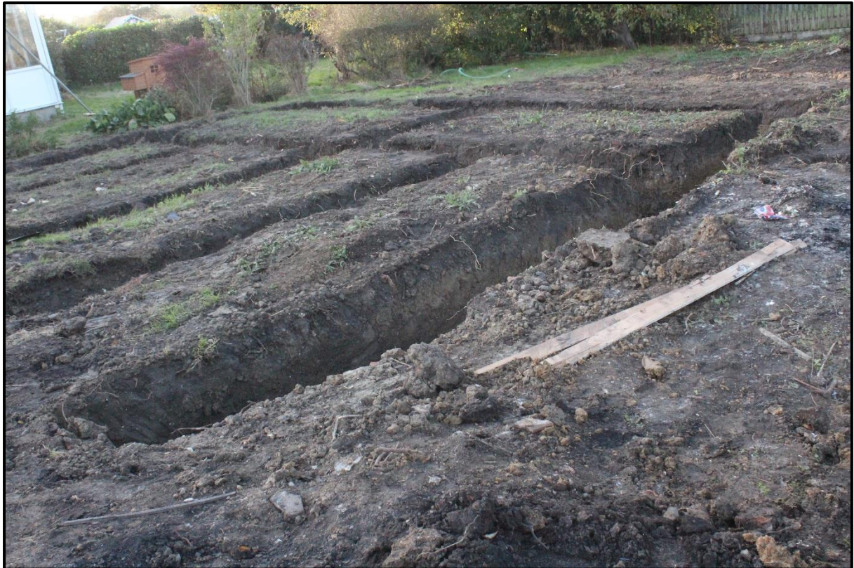
Plate 3 General view of trenches facing west