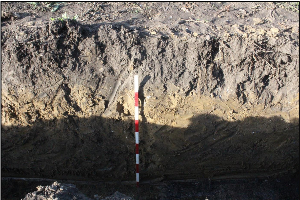
Plate 2 Representative section