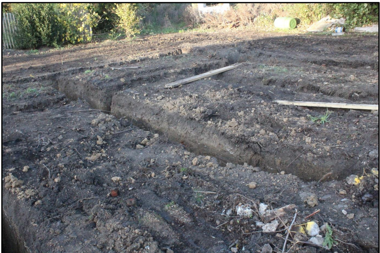
Plate 4 General view of trenches facing north east