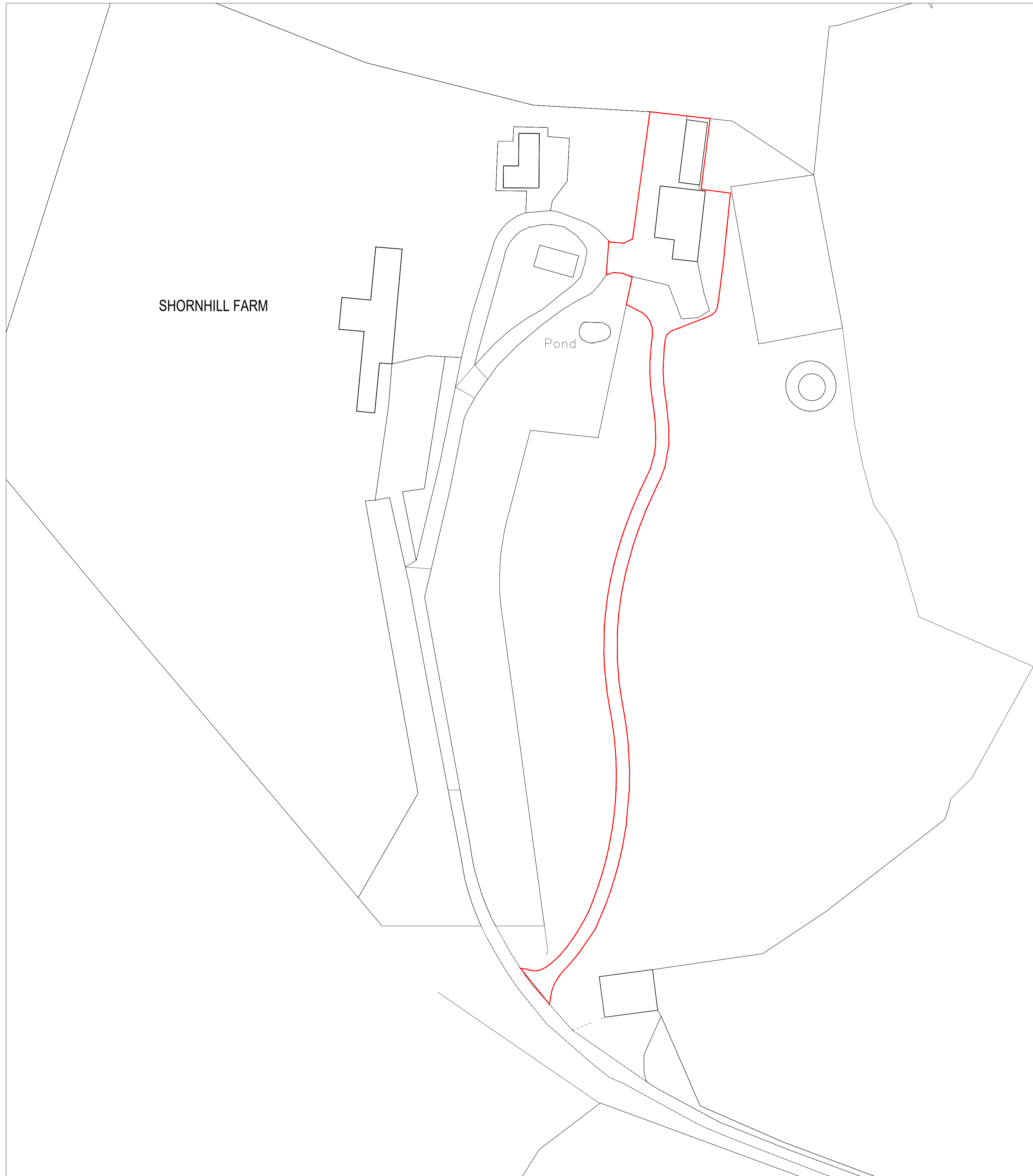
Existing Location - 1:500@A2

Notes: Adjacent Properties and Boundaries are shown for illustrative purposes only and have not been surveyed unless otherwise stated. All areas shown are approximate and should be verified before forming the basis of a decision. Do not scale other than for Planning Application purposes. All dimensions must be checked by the contractor before commencing work on site. No deviation from this drawing will be permitted without the prior written consent of the A. Clarke Design Ltd. The copyright of this drawing remains with the A. Clarke Design Ltd and may not be reproduced in any form without prior written consent. Ground Floor Slabs, Foundations, Sub-Structures, etc. All work below ground level is shown provisionally. Inspection of ground condition is essential prior to work commencing. Reassessment is essential when the ground conditions are apparent and redesign may be necessary in the light of soil conditions found. The responsibility for establishing the soil and sub-soil conditions rests with the contractor.