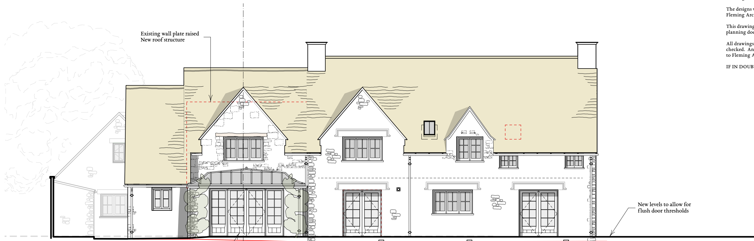
PROPOSED SOUTH ELEVATION Sale 1:100 @ A3