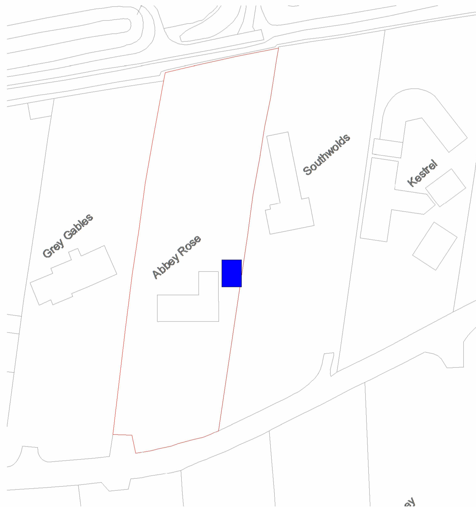
Block Plan 1 : 500