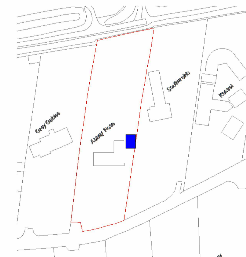
Location Plan 1 : 1250

General Drawings prepared for local authority. Any electrical, heating installation, joinery items, finishes, and fittings to be instructed by the client. The client is to satisfy themselves that any third parties or public services will not affect the proposal. These drawings have been prepared on the understanding that work will not commence on site prior to the granting of planning permission and building regulation approval. All drawings are copyright and may not be used in conjunction with other projects. CDM REG 2015 These drawings have been prepared on the understanding that work will not commence on site prior to the granting of planning permission and building regulation approval. At this point the designers work is complete, hence the designer of this drawing will not be acting as the principal designer in terms of health and safety. Under the new regulations, both the client and the building contractor will have health and safety responsibilities and will need to prepare a construction phase plan for the scheme. The construction phase plan for the scheme should include risk assessment and method statements for elements of the works such as excavations, buried services, risk of electrocution, working at height, lifting and handling, etc. should you require guidance, please see HSE website.