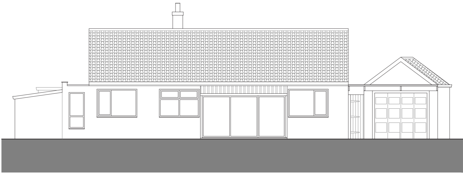
EXISTING REAR ELEVATION 1:100 @ A2