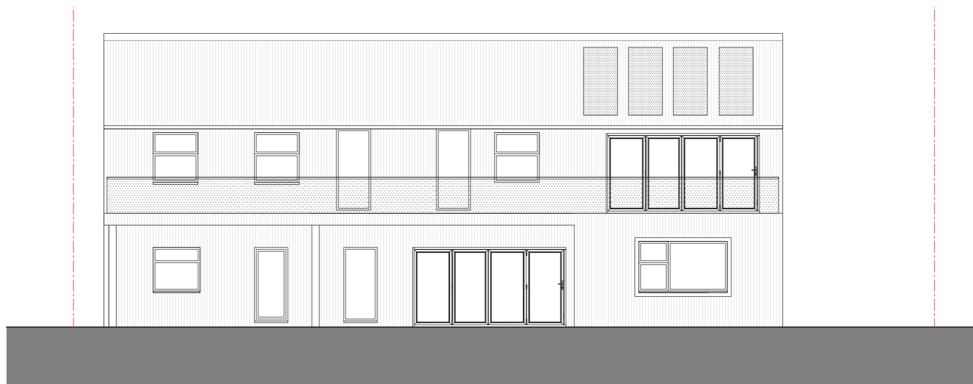
PROPOSED REAR ELEVATION 1:100 @ A2