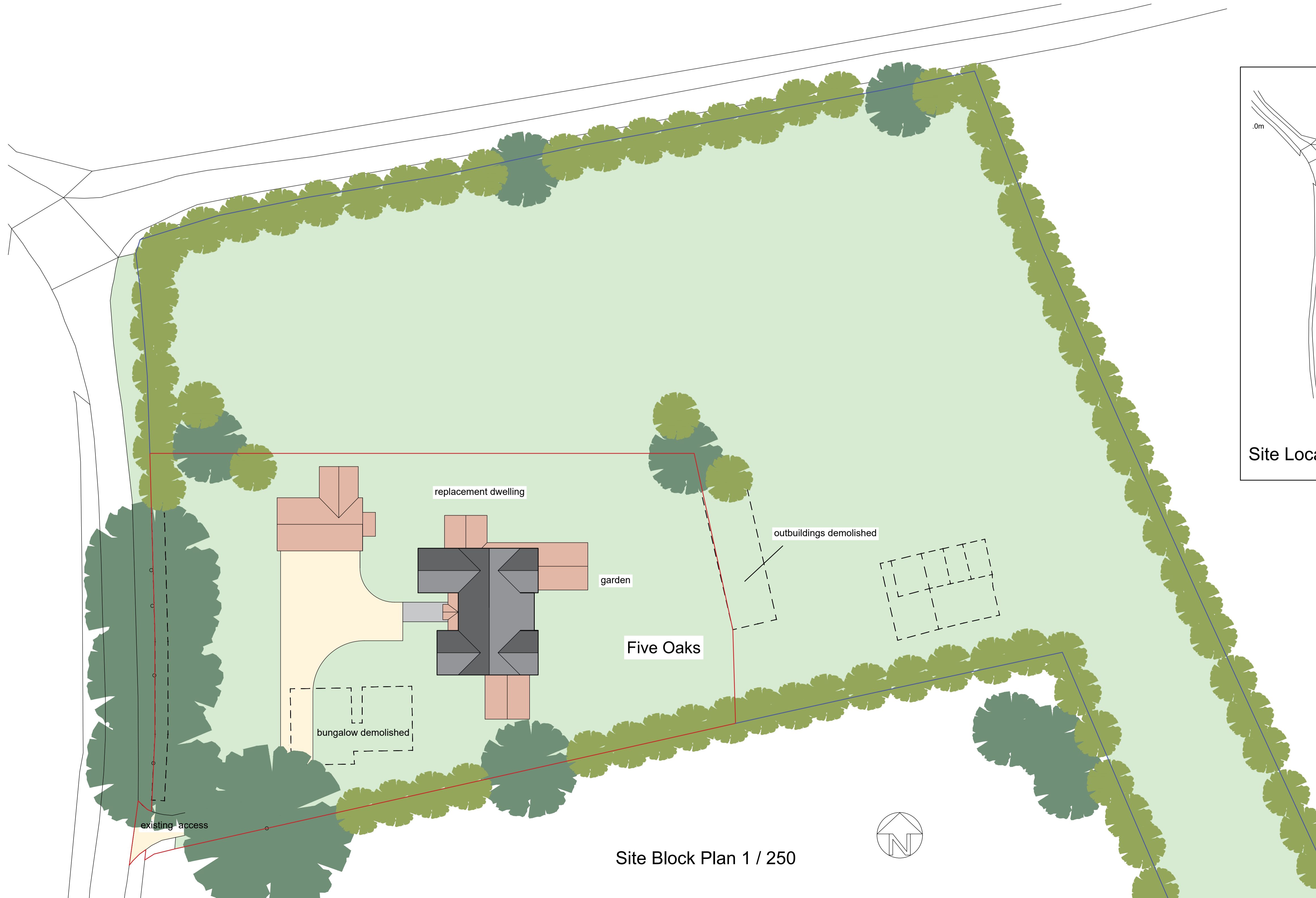
Site Block Plan 1 / 250