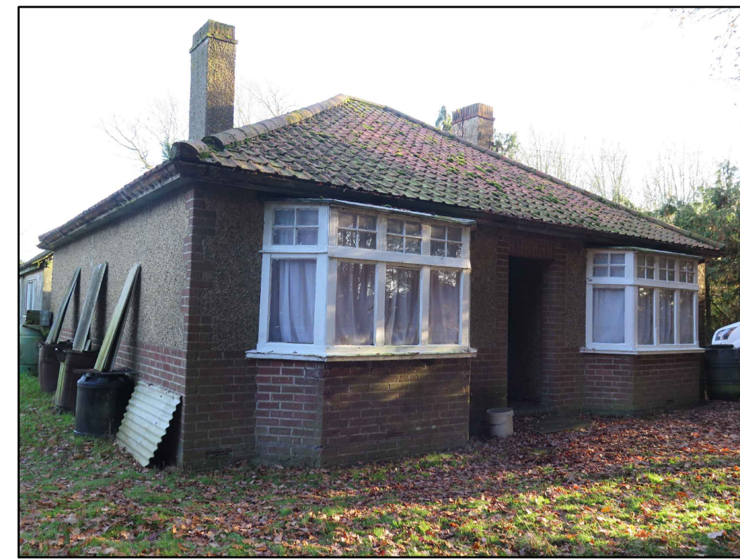
West Front Elevation