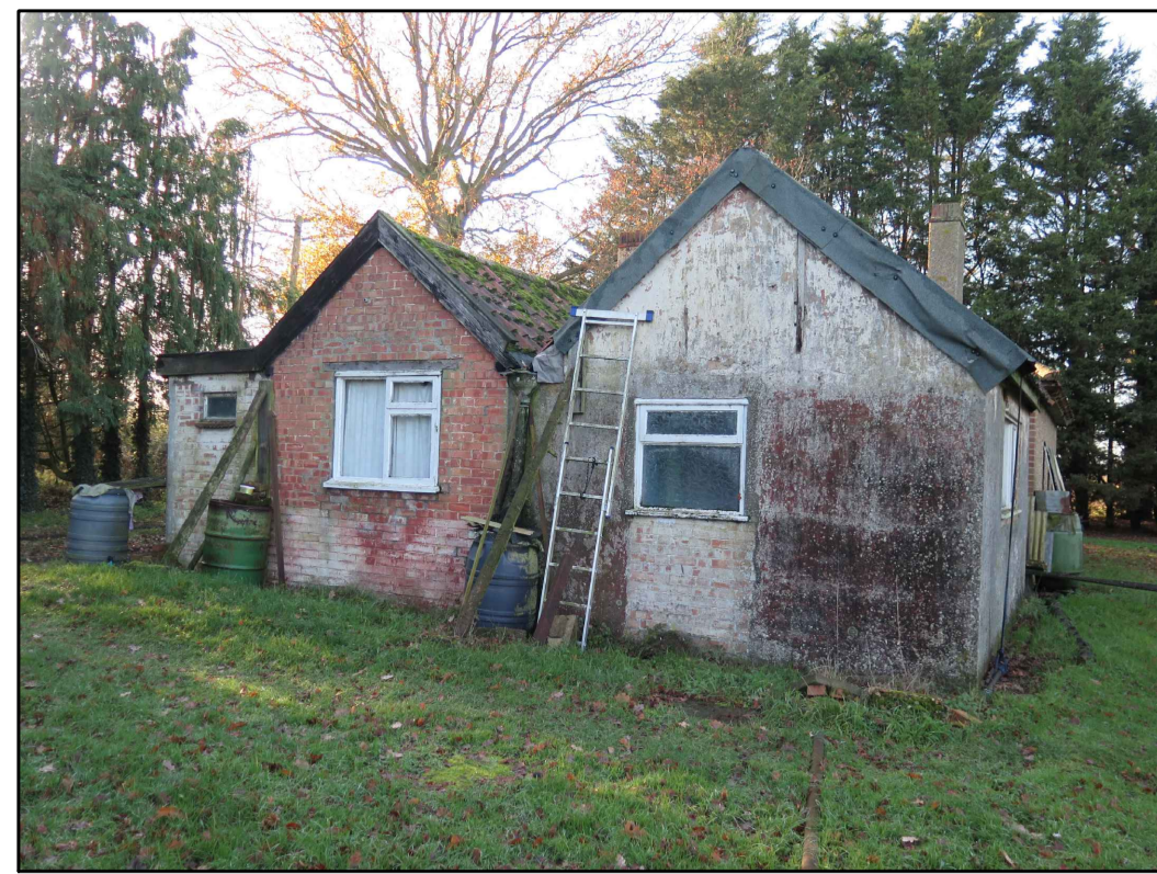
East Rear Elevation