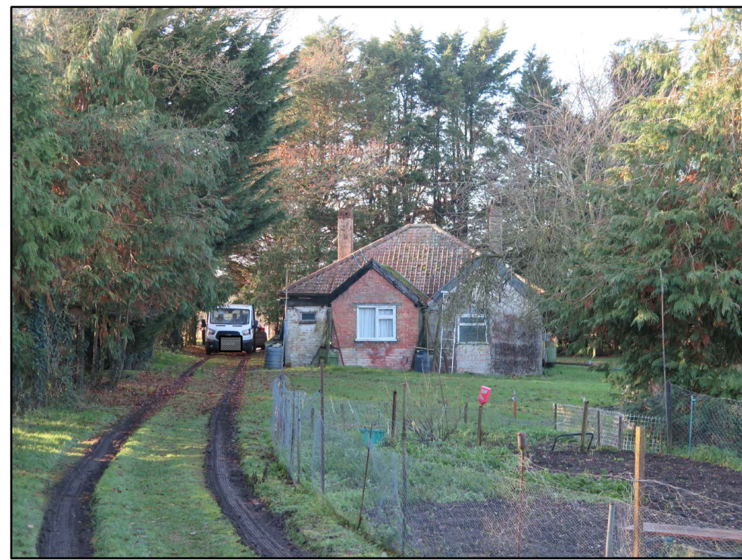
East Rear Elevation