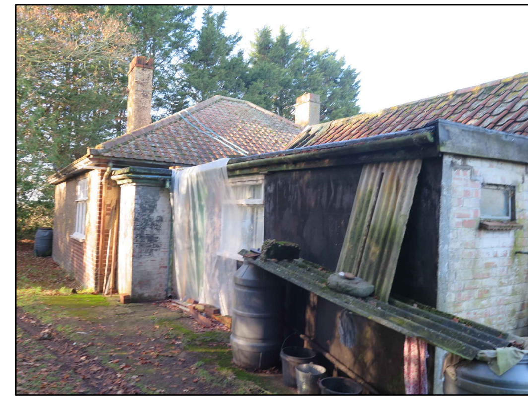
South Side Elevation